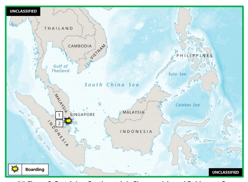
(U) Figure 3. East Asia – Southeast Asia Piracy and Armed Robbery at Sea