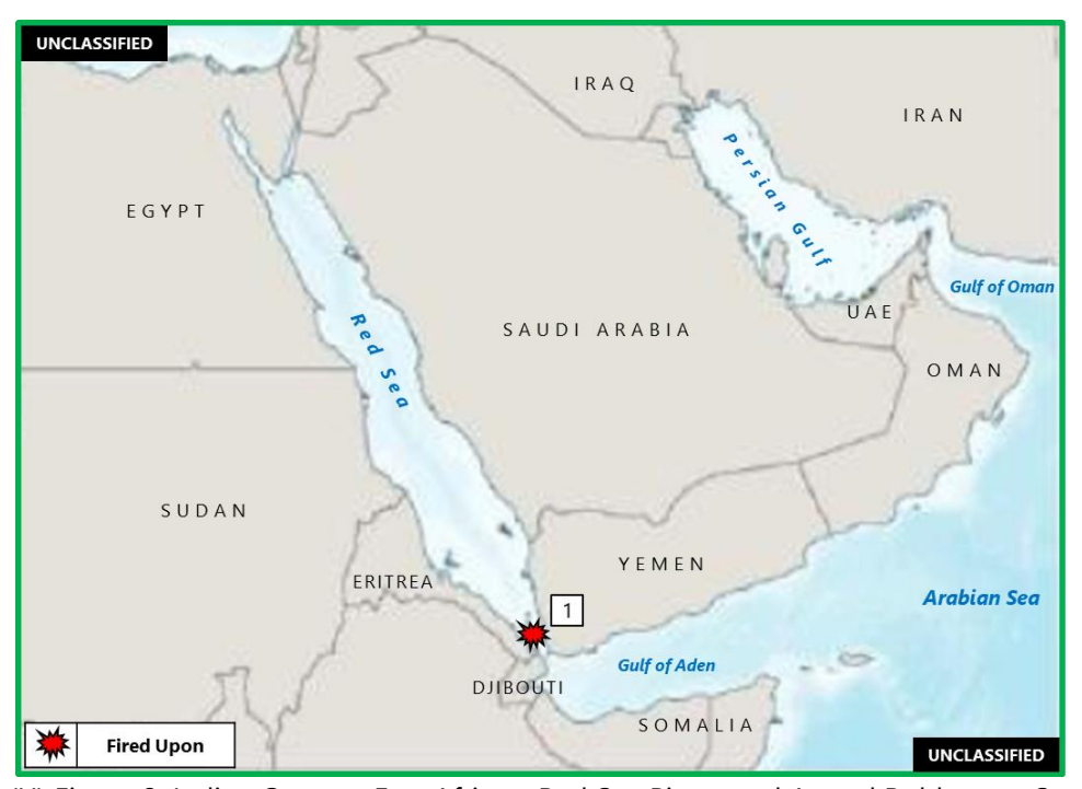
(U) Figure 2. Indian Ocean – East Africa – Red Sea Piracy and Armed Robbery at Sea