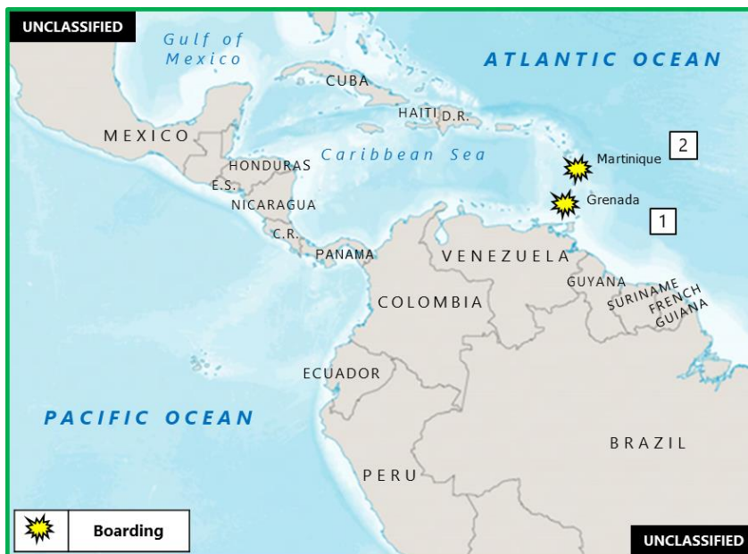
Figure 1. (U) Central America – Caribbean – South America Piracy and Armed Robbery at Sea

1. (U) GRENADA: On 16/17 January between 2230 and 0130 local time, perpetrators stole an unsecured dinghy with a 15HP Yamaha outboard engine from a yacht anchored in Tyrrel Bay near the approximate position 12:27N – 061:29W. An incident report was made on the VHF net and to the local coast guard. (Caribbean Safety and Security Net)