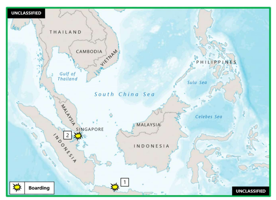
Figure 2. (U) East Asia – Southeast Asia Piracy and Armed Robbery at Sea