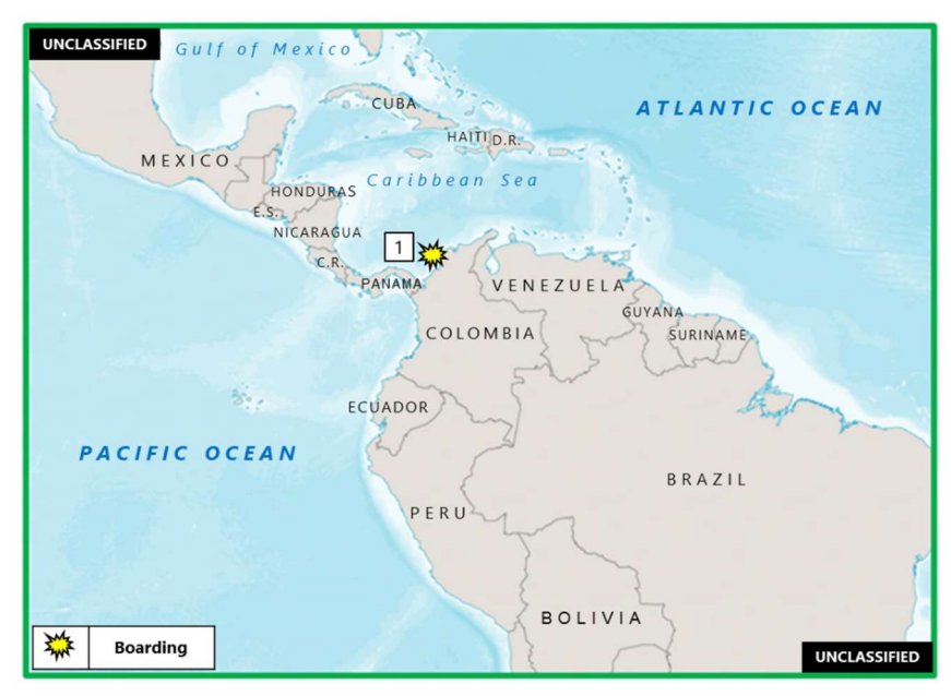
Figure 1. (U) Central America – Caribbean – South America Piracy and Armed Robbery at Sea

1. (U) COLOMBIA: On 19 January at 0040 local time, three perpetrators boarded a container ship underway approximately 20.5 NM southwest of Cartagena near position 10:12N – 075:50W. After the crew spotted the perpetrators, the ship's alarm was raised, the crew mustered, and the Colombian Coast Guard was notified. The perpetrators escaped in their boat. The coast guard escorted the vessel to its berth and subsequently boarded the vessel to conduct an investigation. All crew were reported safe. (Clearwater Dynamics; IMB)