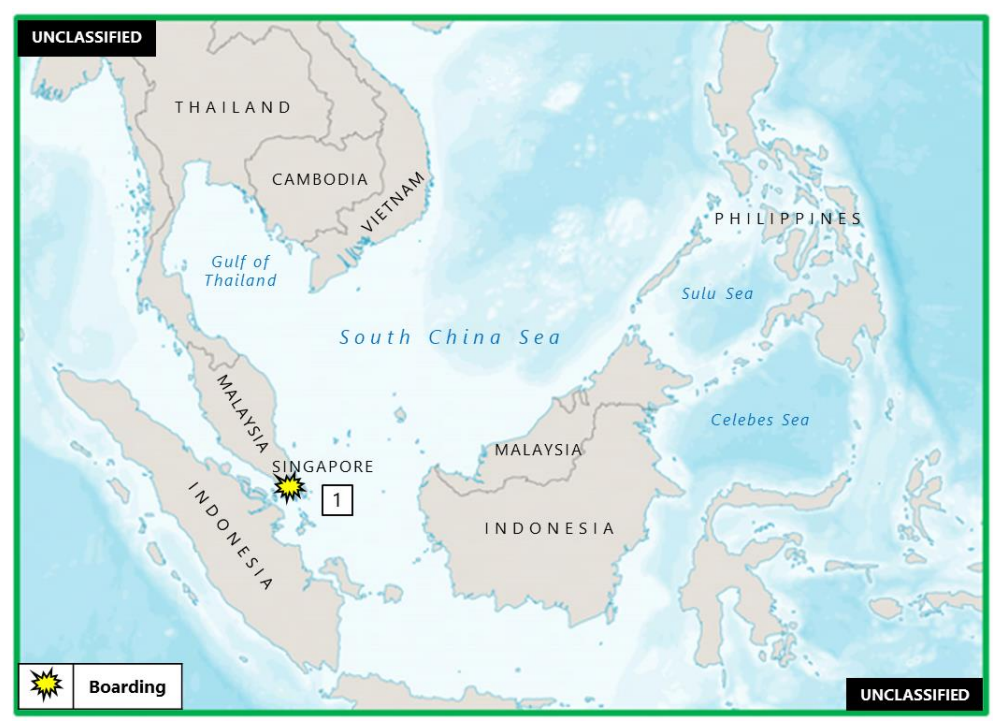
(U) Figure 2. East Asia – Southeast Asia Piracy and Armed Robbery at Sea