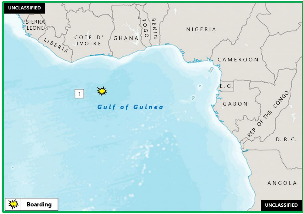
(U) Figure 1. West Africa – Gulf of Guinea Piracy and Armed Robbery at Sea