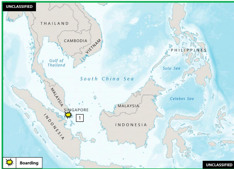
(U) Figure 2. East Asia – Southeast Asia Piracy and Armed Robbery at Sea