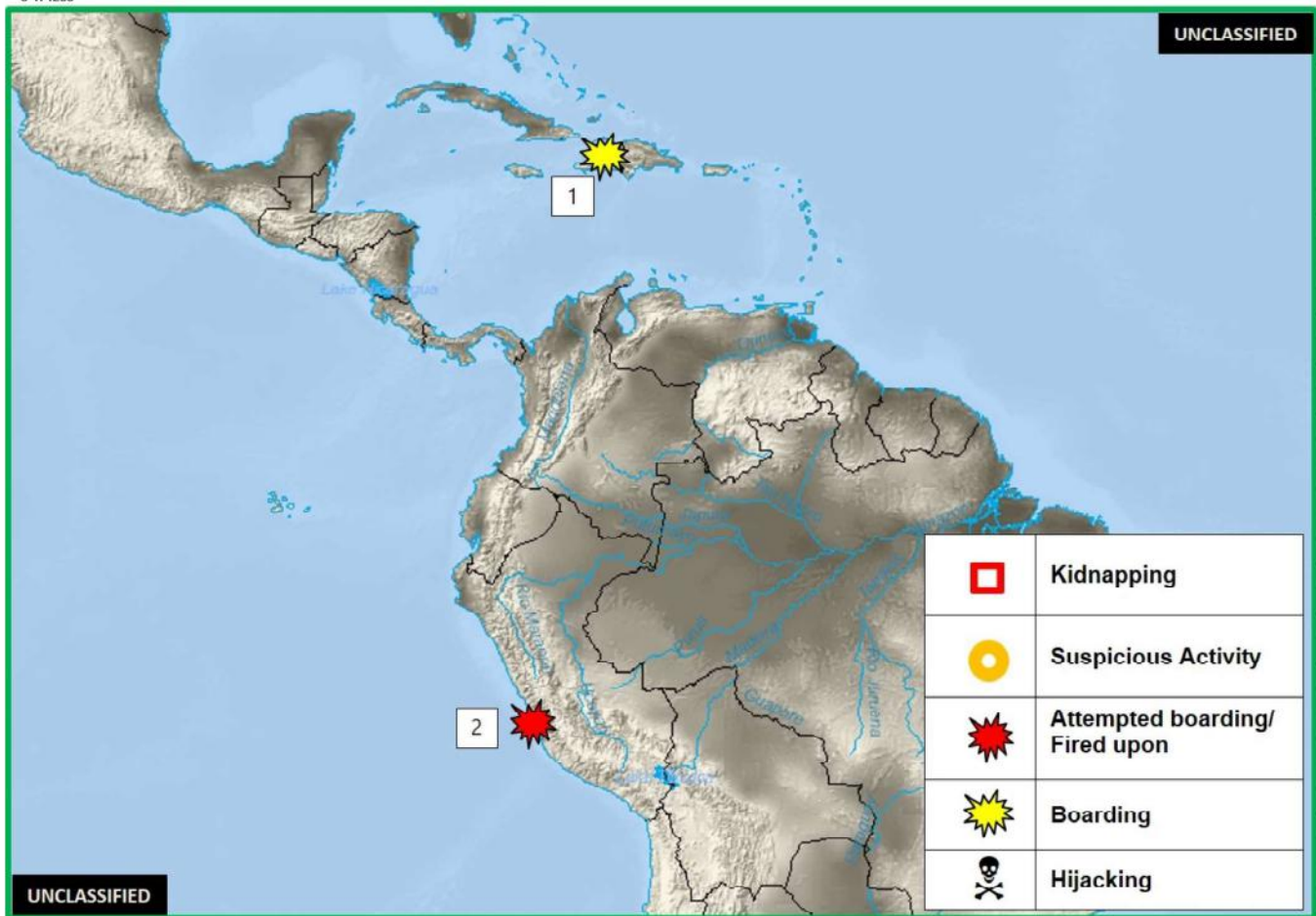
(U) Figure 1. Central America - Caribbean - South America Piracy and Maritime Crime