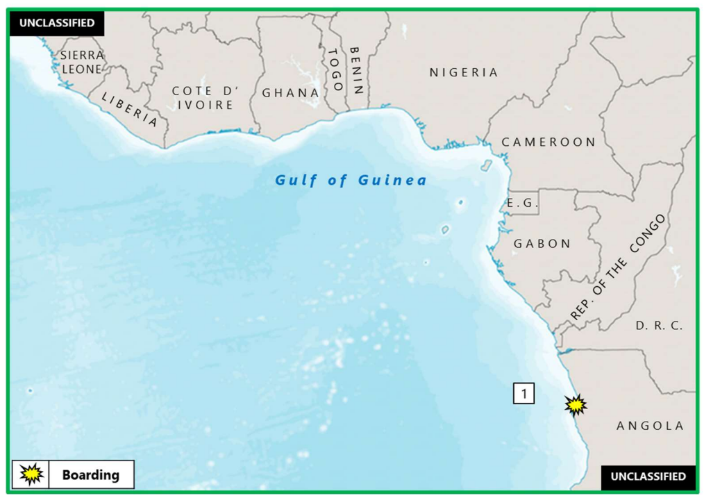
(U) Figure 1. West Africa – Gulf of Guinea Piracy and Armed Robbery at Sea

1. (U) ANGOLA: On 19 April at 0230 local time, one perpetrator boarded an anchored refrigerated cargo ship at Luanda Anchorage near position 08:44S – 013:18E. The duty watchman noticed an unauthorized person climb up the anchor chain and through the hawse pipe while another individual waited below on a small boat. The watchman raised the alarm and mustered the crew. Upon seeing the alerted crew, the perpetrator jumped into the water and escaped in the small boat. The master confirmed that all crew were safe and that nothing was reported stolen. (Clearwater Dynamics)