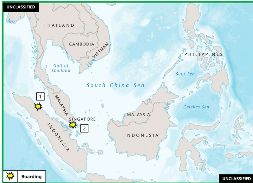
(U) Figure 2. East Asia – Southeast Asia Piracy and Armed Robbery at Sea

1. (U) INDONESIA: On 17 April at 0445 local time, two robbers boarded the anchored Cayman Islands-flagged product tanker STOLT PERSEVERANCE at Belawan Anchorage near position 03:55N – 098:46E in the Malacca Strait. The duty watch observed the robbers near the paint locker and raised the alarm. After hearing the alarm, the robbers escaped by jumping overboard and departed the area in a small boat with stolen ship's stores. (IMB; Clearwater Dynamics; vesseltracker.com)