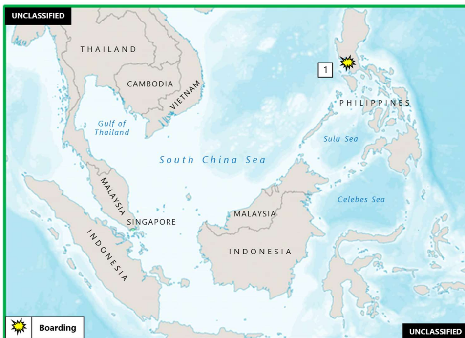
(U) Figure 1. East Asia – Southeast Asia Piracy and Armed Robbery at Sea

1. (U) PHILIPPINES: On 1 May at 0101 local time, two robbers boarded the anchored Panama-flagged container ship SOL STRIDE at Manila Bay Anchorage, near position 14:32N – 120:55E. Duty crew spotted the perpetrators as they escaped by jumping into the sea. Crew members searched the vessel and discovered ship's properties and stores had been stolen. The ship reported the incident to the Philippines Coast Guard who dispatched a patrol vessel to investigate and monitor suspicious boat traffic in the area. All crew members were reported safe. (ReCAAP; Clearwater Dynamics; vesseltracker.com)