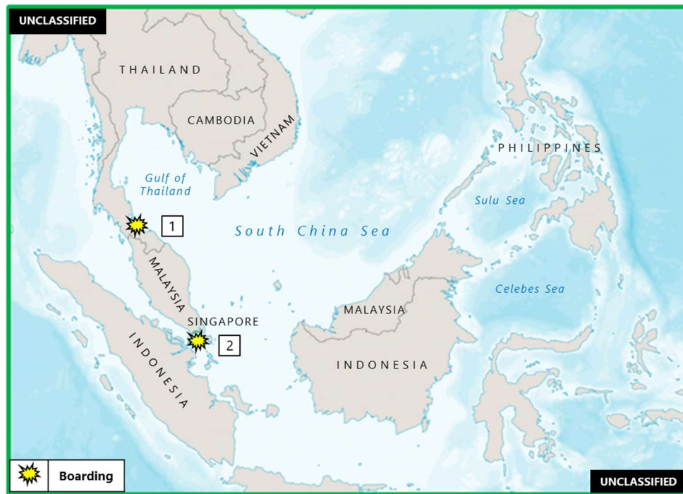
(U) Figure 1. East Asia – Southeast Asia Piracy and Armed Robbery at Sea

1. (U) RED SEA: On 19 April, the Russian-owned motor yacht 30 MINUTES lost contact with its owner while likely off the coast of Yemen. The vessel reportedly departed Jazan, Saudi Arabia en route to Djibouti with three Russian nationals and two Egyptians onboard. The owner stated that the yacht's skipper managed to send a distress call that the yacht was under attack by armed pirates. EUNAVFOR, UKMTO, and U.S. Fifth Fleet have all told press that they are investigating the case. UPDATE: Yacht 30 MINUTES and its five crew members safely reached Djibouti on 27 April after going missing for days following an attack off the Yemeni coast, the owner said. He stated the vessel reached Djibouti after being detained for several days by Eritrean authorities. (Maritime Executive; Associated Press; Reuters)