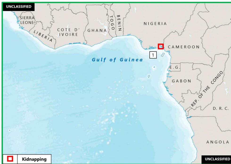
(U) Figure 1. West Africa – Gulf of Guinea Piracy and Armed Robbery at Sea

1. (U) NIGERIA: On 25 May at approximately 1800 local time, an unknown number of perpetrators kidnapped 15 passengers from a local passenger boat transiting from Calabar to Akwa Ibom in the area around the Cross and Calabar Rivers. No ransom demand by the kidnappers has been reported. (dailypost.ng)