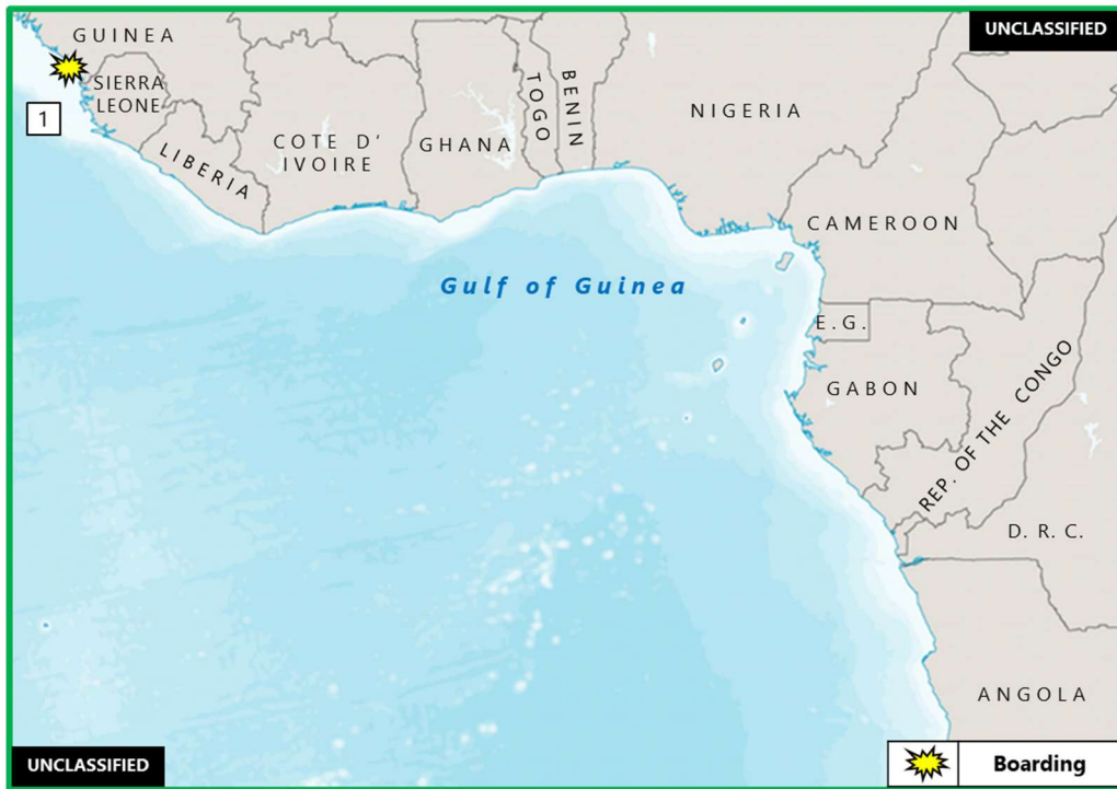
(U) Figure 1. West Africa – Gulf of Guinea Piracy and Armed Robbery at Sea

1. (U) GUINEA: On 22 June at 0435 local time, four armed robbers boarded an anchored cargo ship approximately 14 NM south of Conakry, near position 09:13N – 013:50W. They used force to steal money from the ship's safe and escaped. All crew were reported safe. (MDAT-GoG; Clearwater Dynamics)