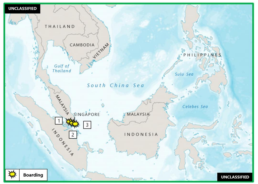
(U) Figure 2. East Asia – Southeast Asia Piracy and Armed Robbery at Sea

1. (U) INDONESIA: On 16 July at 0235 local time, five perpetrators boarded the underway Panama-flagged bulk carrier MSM in the eastbound lane of the Singapore Strait Traffic Separation Scheme (TSS), near position 01:08N – 103:27E. The crew sighted five perpetrators in the engine room. The ship sounded the alarm and the crew mustered. All crew reported safe with no injuries. The crew conducted a search onboard with no further sighting of the perpetrators. The vessel reported nothing stolen. The vessel did not require assistance and continued its voyage to Singapore. (Clearwater Dynamics; ReCAAP)