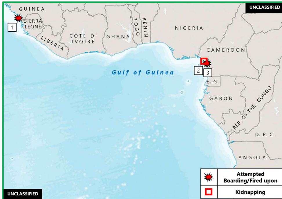
(U) Figure 1. West Africa – Gulf of Guinea Piracy and Armed Robbery at Sea

1. (U) GUINEA: On 5 July at 0200 local time, six perpetrators attempted to board a tanker anchored 14 NM south of Conakry, near position 09:17N – 013:45W. Duty crew spotted the perpetrators trying to board the tanker from a small boat using a ladder. Duty crew directed a light at the individuals attempting to board, causing them to flee empty-handed. (Clearwater Dynamics; IMB)