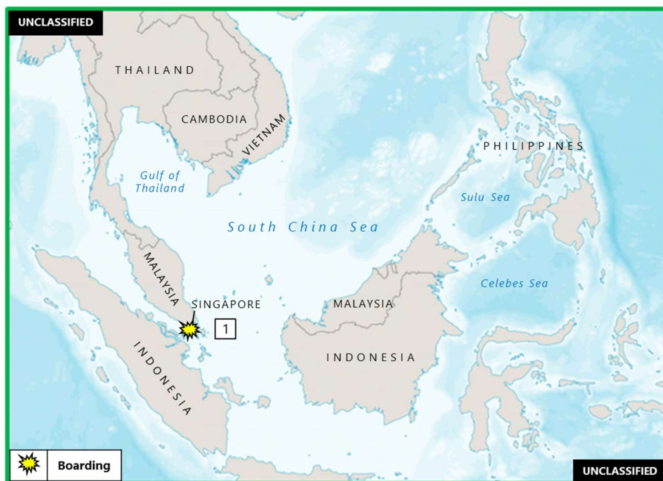
(U) Figure 2. East Asia – Southeast Asia Piracy and Armed Robbery at Sea

1. (U) YEMEN: On 27 June at 0921 local time, two skiffs with up to six persons armed with guns onboard each skiff approached to within 50 meters on the port side of an underway tanker approximately 20 NM west of Al Hudaydah, near position 14:46N – 042:34E. No shots were fired. The vessel increased speed and commenced evasive maneuvers, resulting in the skiffs departing the area. The tanker and crew are safe. (UKMTO; Clearwater Dynamics; IMB)