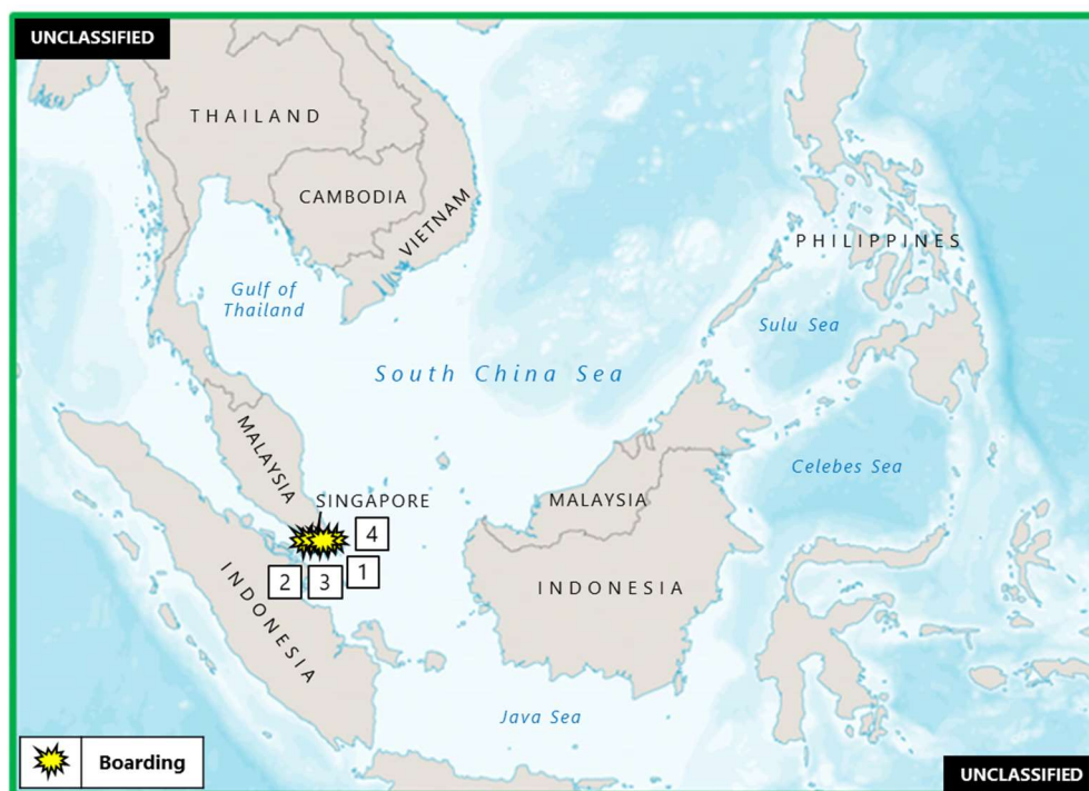
(U) Figure 2. East Asia – Southeast Asia Piracy and Armed Robbery at Sea

1. (U) INDONESIA: On 9 August at 0335 local time, three unarmed robbers boarded the underway Cyprus-flagged bulk carrier SOPHOCLES GRAECIA in the eastbound lane of the Singapore Strait Traffic Separation Scheme (TSS), near position 01:04N – 103:42E. Crew discovered the perpetrators in the engine room. The alarm was raised and crew mustered. A search of the ship found no further sign of the robbers onboard. The master reported that all crew were safe and that main engine spare parts were missing. Crew conducting a subsequent security check of the vessel found a plastic molded replica toy gun. The ship reported the incident to the local authorities, Singapore Police Coast Guard boarded and searched the ship after it arrived in port. (ReCAAP; Clearwater Dynamics)