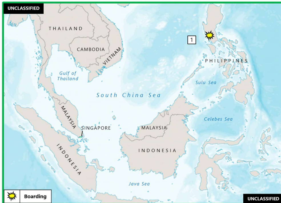
(U) Figure 1. East Asia – Southeast Asia Piracy and Armed Robbery at Sea

1. (U) PHILIPPINES: On 11 August at 0002 local time, eight perpetrators armed with guns boarded the Malta-flagged container ship CNC PLUTO anchored at Manila Anchorage, near position 14:35N – 120:50E. They took a duty crewman hostage, tied him up, and stole his cell phone. The bridge sounded the alarm and the crew mustered. Seeing the alerted crew, the perpetrators fled the ship. The ship reported the incident to local authorities and the Philippine Coast Guard arrived and boarded the ship to investigate. (IMB; Clearwater Dynamics; vesseltracker.com)