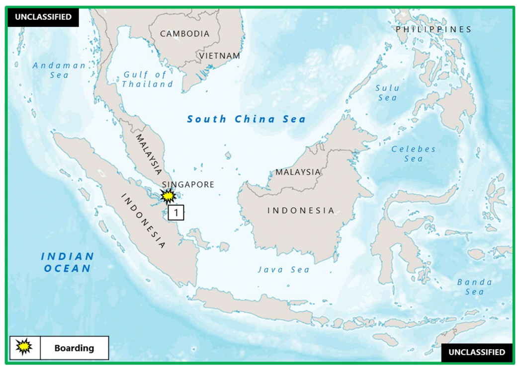
(U) Figure 1. East Asia – Southeast Asia Piracy and Armed Robbery at Sea

1. (U) INDONESIA: On 8 August at 2036 local time, 10 robbers armed with knives and steel bars boarded a bulk carrier underway off Tanjung Balai Karimum in the Singapore Strait, near position 01:02N – 103:30E. The robbers entered the engine control room, where they took the third engineer hostage and tied him up. The robbers subsequently escaped with stolen engine spares. Following the activation of the dead man alarm, the chief engineer found the third engineer tied up in the engine room and informed the master. The master raised the general alarm and reported the incident to the Singapore vessel traffic service. Singapore Coast Guard boarded the vessel to investigate the incident. (IMB; Clearwater Dynamics)