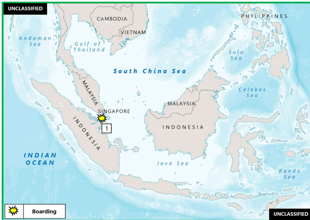
(U) Figure 1. East Asia – Southeast Asia Piracy and Armed Robbery at Sea

1. (U) INDONESIA: On 8 August at 2036 local time, 10 robbers armed with knives and steel bars boarded a bulk carrier underway off Tanjung Balai Karimum in the Singapore Strait, near position 01:02N – 103:30E. The robbers entered the engine control room, where they took the third engineer hostage and tied him up. The robbers subsequently escaped with stolen engine spares. Following the activation of the dead man alarm, the chief engineer found the third engineer tied up in the engine room and informed the master. The master raised the general alarm and reported the incident to the Singapore vessel traffic service. Singapore Coast Guard boarded the vessel to investigate the incident. (IMB; Clearwater Dynamics)