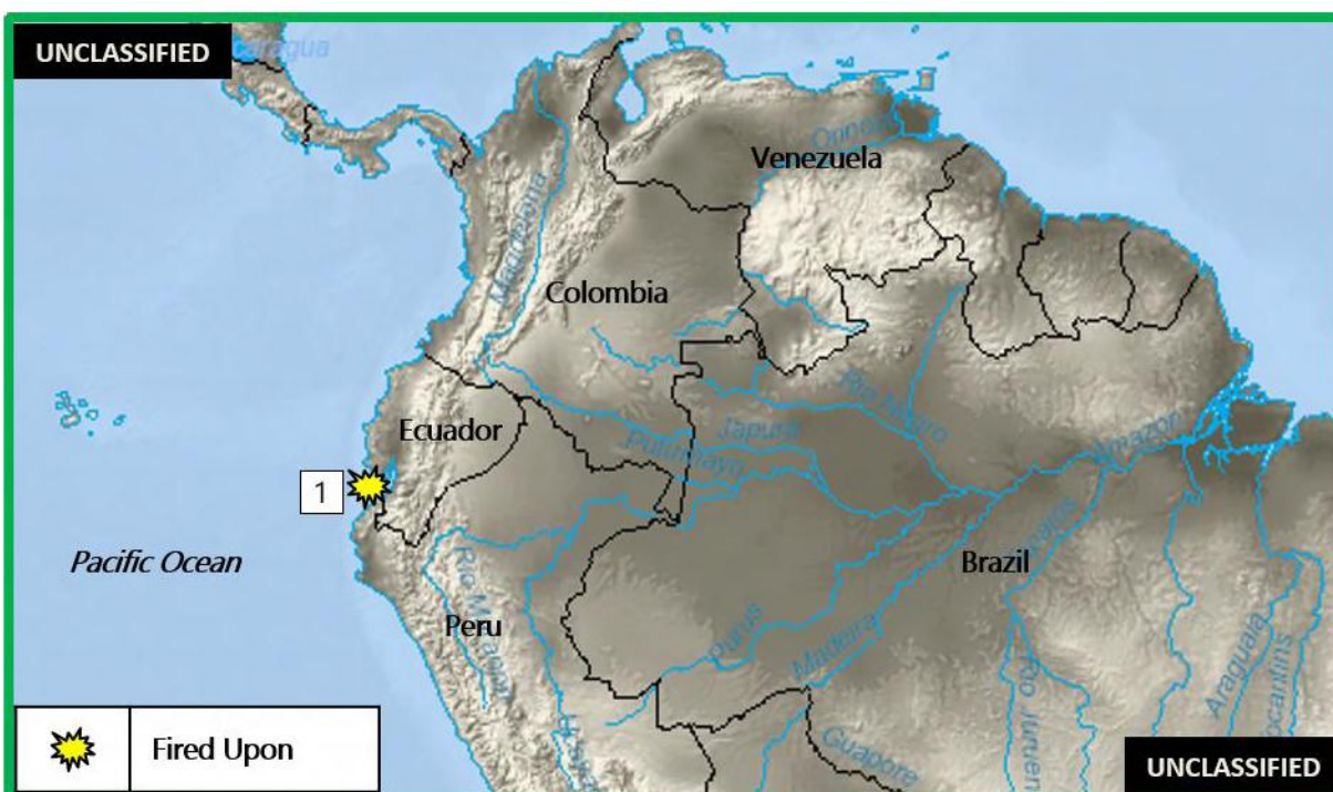
Figure 1. South America Piracy and Maritime Crime

1. (U) ECUADOR: On 2 May at 2315LT, seven men in a skiff chased and fired upon an underway container vessel 4 NM south of Posoria at 02:46S - 080:14W. The crew mustered and directed the search light towards the skiff. When Coast Guard officials onboard the vessel fired four warning shots, the skiff departed. (IMB, Clearwater Dynamics)