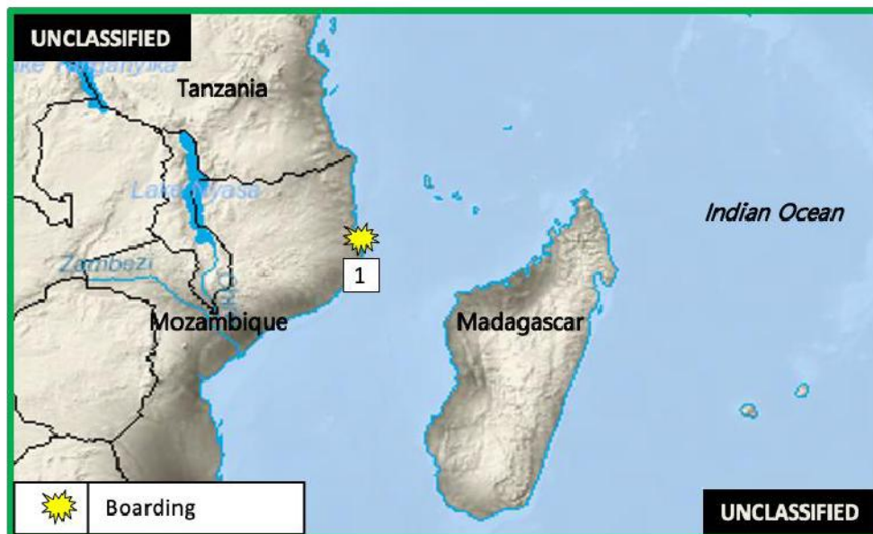
Figure 3. East Africa Piracy and Maritime Crime

1. (U) MOZAMBIQUE: On 10 May at 2250LT, a robber boarded a tanker during cargo operations at Nacala Anchorage at 14:30S - 040:39E. When spotted by the crew, the robber fled empty handed to a waiting boat with two other individuals. The incident was reported to Port Control. (IMB, Clearwater Dynamics)