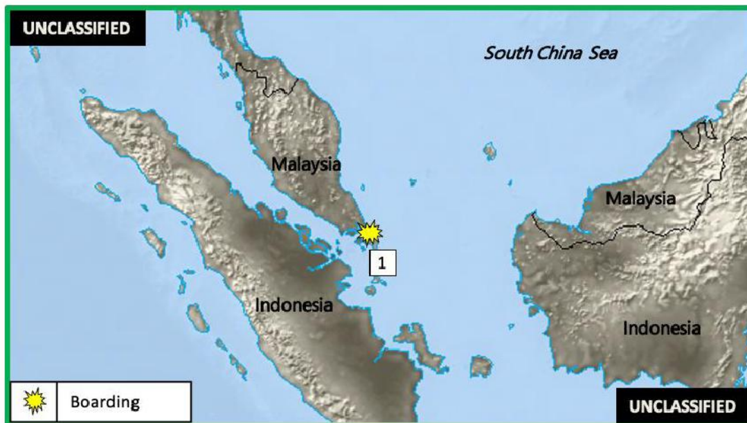
Figure 4. Southeast Asia Piracy and Maritime Crime

1. (U) INDONESIA: On 9 May at 2345LT, five robbers armed with knives boarded a bulk carrier underway in the Traffic Separation Scheme in the Singapore Straits approximately 13 NM east of Singapore at 01:15.10N - 104:05.48E. The robbers confronted the duty ordinary seaman and stole his cellular phone. The ordinary seaman managed to escape and alert the crew. The crew subsequently searched the vessel and determined that the robbers had also stolen two breathing apparatuses. The ordinary seaman sustained a minor head injury during the incident. The master reported the incident to Singapore VTIS. (Clearwater Dynamics, ReCAAP)