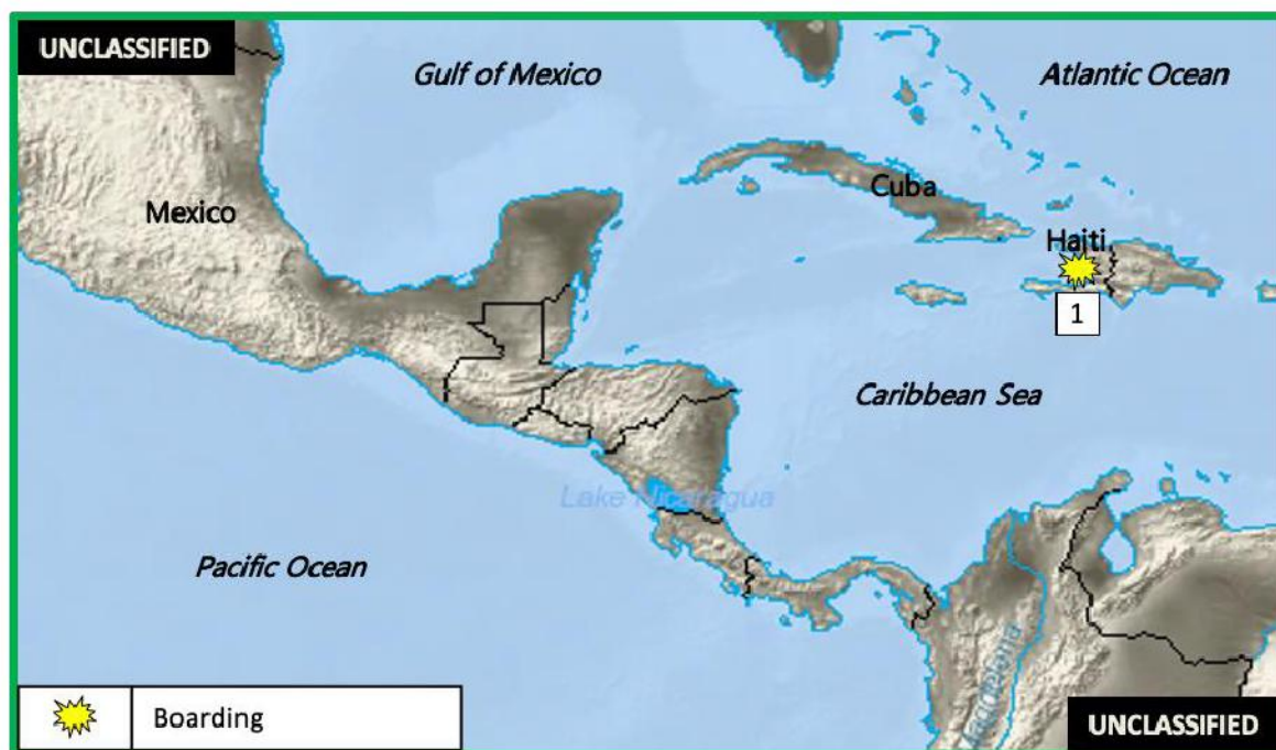
Figure 1. Caribbean Piracy and Maritime Crime

B. (U) CENTRAL AMERICA - CARIBBEAN - SOUTH AMERICA: