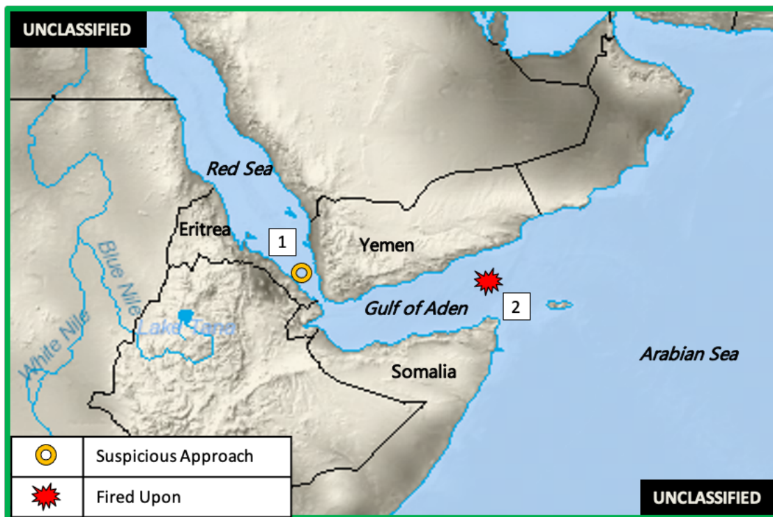
Figure 2. East Africa Piracy and Maritime Crime

1. (U) ERITREA: On 20 May at 0430LT, the Captain of a tanker transiting north in the Red Sea spotted two high-speed skiffs approximately 48 NM southwest of Hodeidah Port, Yemen near position 14:24N – 042:11E. When the skiffs changed course to intercept the tanker, the Captain changed course and increased speed. The skiffs approached to within .5 NM during the incident. There were seven individuals onboard each skiff carrying objects, possibly weapons. The skiffs also had black flags with white Arabic letters. The skiffs passed the tanker's starboard side and continued clear of the vessel stern. The individuals in the skiffs made no attempt to board or chase the tanker. (Clearwater Dynamics)