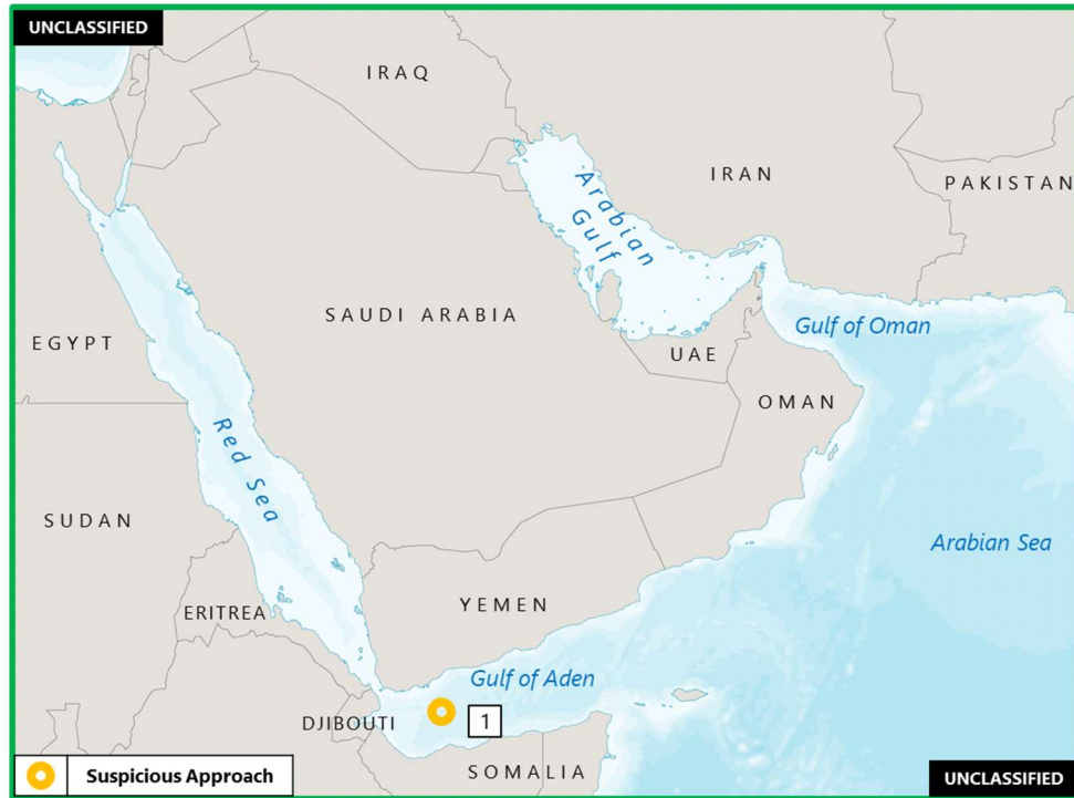
(U) Figure 2. Indian Ocean – East Africa – Red Sea Suspicious Approach

H. (U) INDIAN OCEAN – EAST AFRICA – RED SEA: