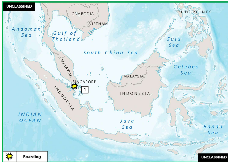
(U) Figure 3. East Asia – Southeast Asia Piracy and Armed Robbery at Sea

1. (U) INDONESIA: On 8 October at 0001 local time, two perpetrators armed with knives boarded the underway Cyprus-flagged bulk carrier DIMITRIS A in the eastbound lane of the Singapore Strait Traffic Separation Scheme, near position 01:03N – 103:40E. The duty crew sighted the perpetrators in the engine room. The ship's master raised the alarm and the crew conducted a search. Following the search, the ship reported that all crew were accounted for and nothing was stolen. The vessel did not require assistance and continued its voyage to Singapore. (Clearwater Dynamics; vesseltracker.com; ReCAAP)