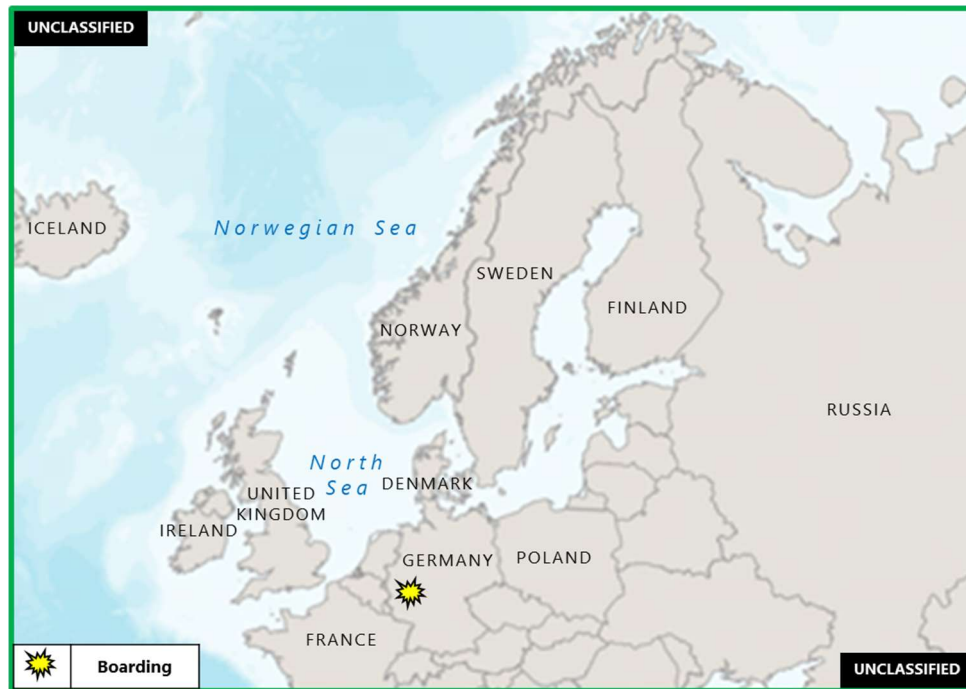
(U) Figure 1. Northern Europe – Baltic Piracy and Riverine Armed Robbery

1. (U) GERMANY: On the night of 6–7 October, an unknown number of robbers boarded the moored Switzerland-flagged passenger ship OLYMPIA on the Moselle River close to its confluence with the Rhine River in the city of Koblenz, near position 50:21N – 007:35E, and took the ship's 50-kg copper bell, secured with a lock, from the upper deck. Further damage occurred when the perpetrators broke into the ship's interior and stole other ship's properties. The Koblenz water police are investigating the incident. (vesseltracker.com)