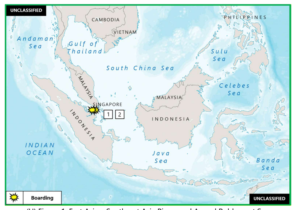
(U) Figure 1. East Asia – Southeast Asia Piracy and Armed Robbery at Sea

1. (U) INDONESIA: On 16 October, five robbers armed with knives and machetes boarded the underway Panama-flagged tanker PS FALCON in the eastbound lane of the Singapore Strait Traffic Separation Scheme (TSS), near position 01:04N – 103:42E. The duty crew spotted the robbers in the engine room. The perpetrators tied up five crew members, and hit one of the restrained crew members on the head. The master raised the alarm, and mustered the crew. Following the incident, the master reported that no medical assistance was required, and that ship's properties had been stolen. The vessel continued its passage to Hong Kong. (Clearwater Dynamics; ReCAAP)