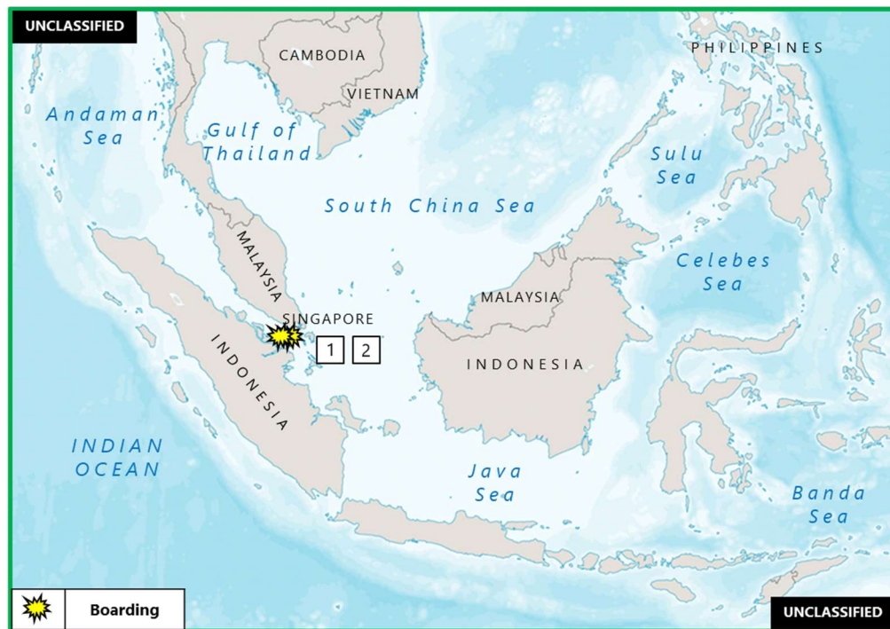
(U) Figure 1. East Asia – Southeast Asia Piracy and Armed Robbery at Sea

1. (U) YEMEN: On 5 October at 1200 local time, as many as 10 small craft approached an underway merchant vessel to within 50 to 100 meters in the Gulf of Aden, approximately 59 NM southeast of Aden, near position 11:57N – 045:25E. The vessel's crew observed ladders onboard two of the boats. The ship raised the alarm and notified authorities. The small craft continued to follow for 15 minutes, then turned away. Crew and vessel were reported safe. (UKMTO; Clearwater Dynamics)