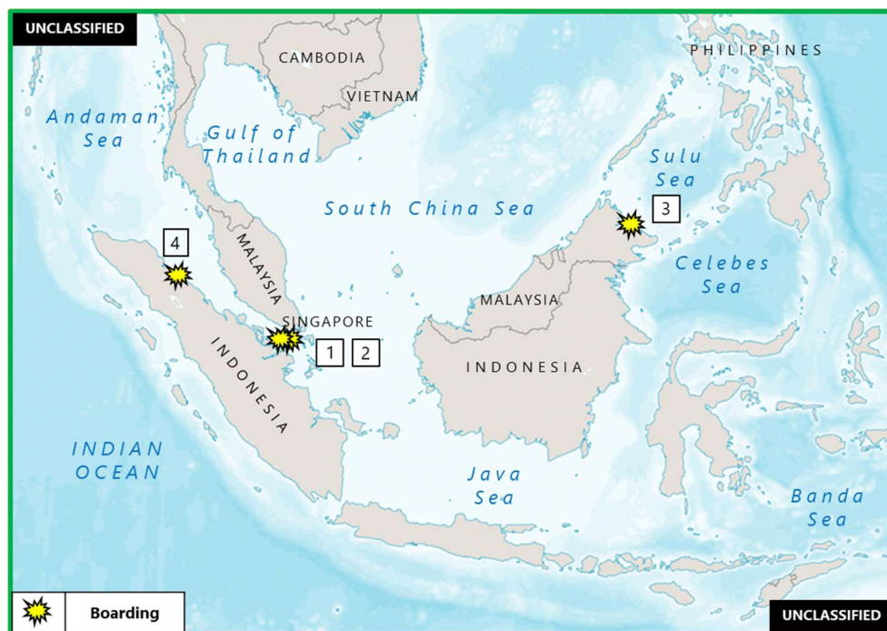
(U) Figure 1. East Asia – Southeast Asia Piracy and Armed Robbery at Sea

1. (U) YEMEN: On 5 October at 1200 local time, as many as 10 small craft approached an underway merchant vessel to within 50 to 100 meters in the Gulf of Aden, approximately 59 NM southeast of Aden, near position 11:57N – 045:25E. The vessel's crew observed ladders onboard two of the boats. The ship raised the alarm and notified authorities. The small craft continued to follow for 15 minutes, then turned away. Crew and vessel were reported safe. (UKMTO; Clearwater Dynamics)