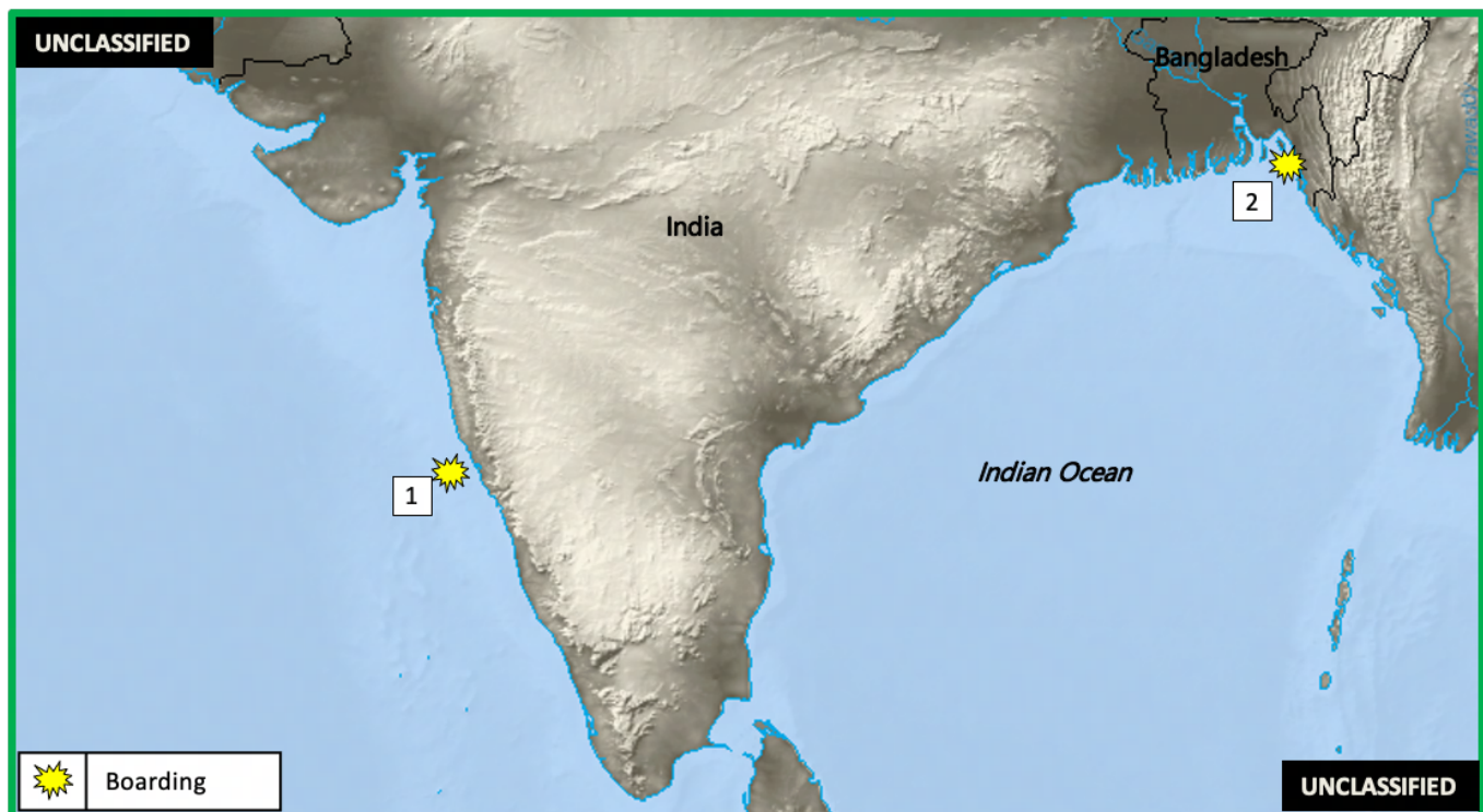
Figure 3. Indian Subcontinent Piracy and Maritime Crime

1. (U) INDIA: On 29 May at 0800LT, 15 robbers in a fishing trawler came alongside and boarded another fishing trawler approximately 65 NM off Goa and Malvan (Maharashtra) at 15:30N - 072:50E. The robbers held the crew hostage and escaped with stolen fish, navigational equipment, and a wireless communication system. The incident was reported to the local police who succeeded in arresting the robbers and recovering all of the stolen goods. (Goa News Hub)