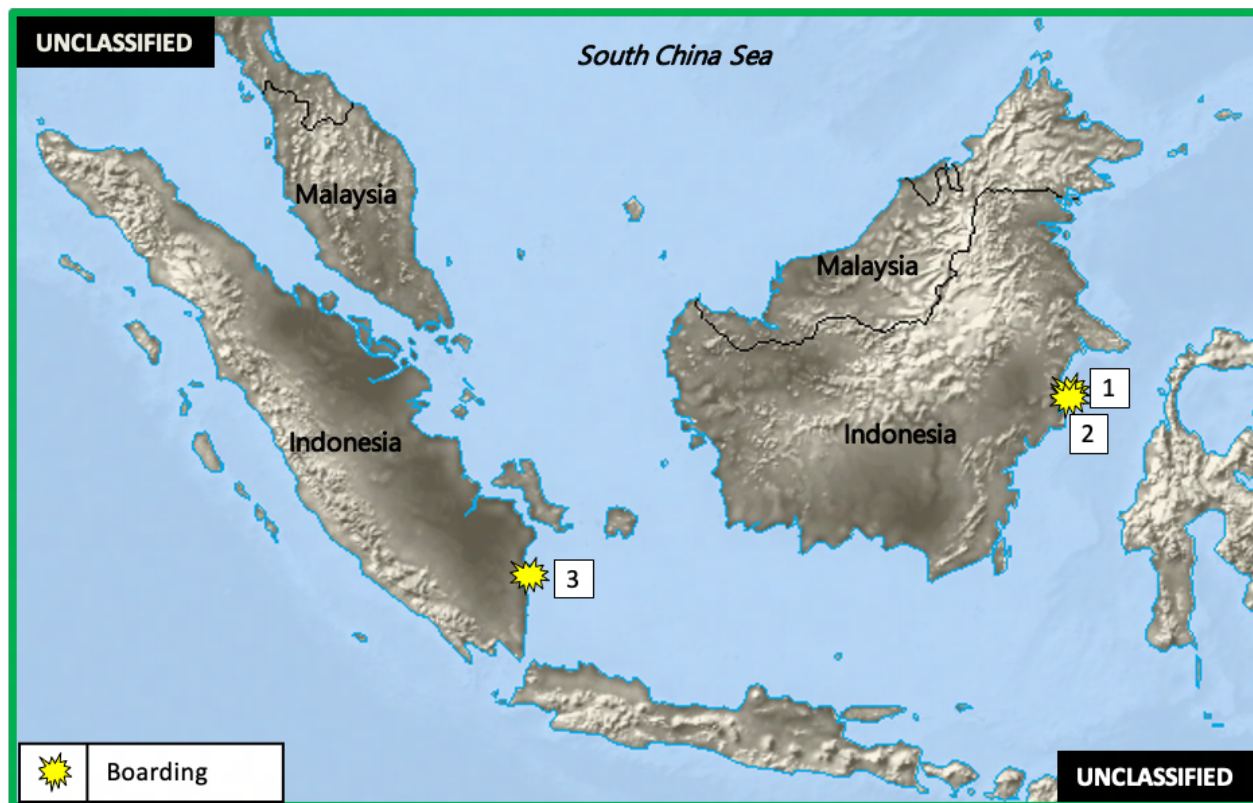
Figure 2. Southeast Asia Piracy and Maritime Crime