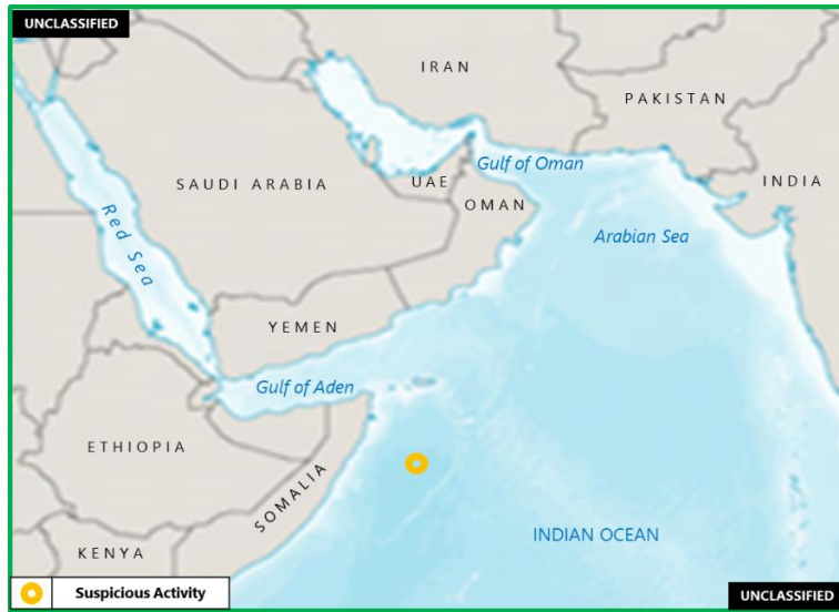
(U) Figure 3. Indian Ocean – East Africa – Red Sea Suspicious Activity

1. (U) INDIAN OCEAN: On 1 November at 1338 UTC, UKMTO reported a distress alert in the vicinity of 500 NM northeast of Mogadishu, Somalia. The chief security officer later reported to UKMTO that the vessel is safe and proceeding to the nearest port. (UKMTO; Clearwater Dynamics)