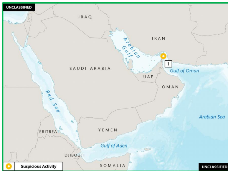
(U) Figure 2. Arabian Gulf Suspicious Activity

1.(U) STRAIT OF HORMUZ: On 1 November at 1830 UTC, the United Kingdom Maritime Trade Operations (UKMTO) received reports of uncrewed aerial system (UAS) activity in the vicinity of the Strait of Hormuz Traffic Separation Scheme, near position 26:35N – 056:28E. (UKMTO; Clearwater Dynamics)