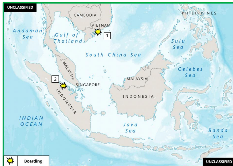
(U) Figure 4. East Asia – Southeast Asia Piracy and Armed Robbery at Sea