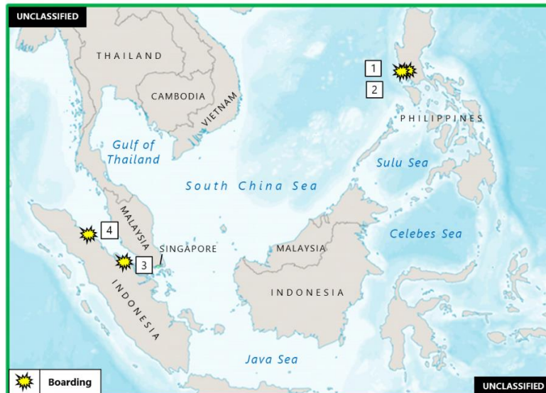
(U) Figure 3. East Asia – Southeast Asia Piracy and Armed Robbery at Sea

1. (U) PHILIPPINES: On 26 November at around 0245 local time, five robbers boarded the anchored Liberia-flagged container ship G CROWN at Manila Bay Anchorage, near position 14:36N – 120:49E. The perpetrators boarded the vessel through the hawse pipe. The duty crew observed the robbers and raised the alarm. The robbers, noting the alerted crew, escaped with stolen ship's properties. The ship informed authorities and a coast guard patrol boat was sent to the vicinity. (IMB; Clearwater Dynamics; vesseltracker.com)