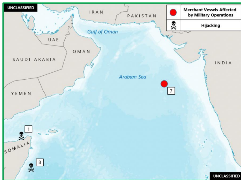
(U) Figure 2. Indian Ocean – East Africa Piracy and Armed Robbery at Sea

1. (U) GULF OF ADEN: On 29 November at 1106 UTC, up to eight perpetrators armed with automatic rifles and rocket propelled grenades hijacked an Iran-flagged fishing vessel operating off Quandala, Somalia, near position 11:34N – 049:55E. The fishing vessel had reportedly engaged in illegal, unreported and unregulated (IUU) fishing in the area. (Clearwater Dynamics)