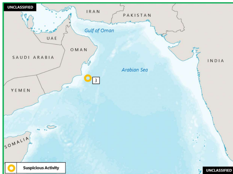
(U) Figure 2. Indian Ocean – East Africa Piracy and Armed Robbery at Sea

1. (U) RED SEA: On 14 December at 1146 UTC, a vessel reported an explosion 50 meters off its port quarter while underway near position 13:41N – 042:38E. Authorities are investigating. Vessels are advised to transit with caution and report any suspicious activity to UKMTO. (UKMTO; Clearwater Dynamics)