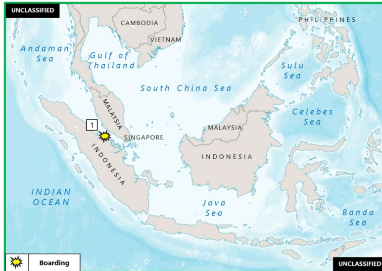
(U) Figure 3. East Asia – Southeast Asia Piracy and Armed Robbery at Sea

33. (U) RED SEA: On 6 December at 0718 UTC, UKMTO received a report of a drone loitering 49 NM southwest of Hodeida, Yemen, near position 14:25N – 042:12E. (UKMTO; Clearwater Dynamics)