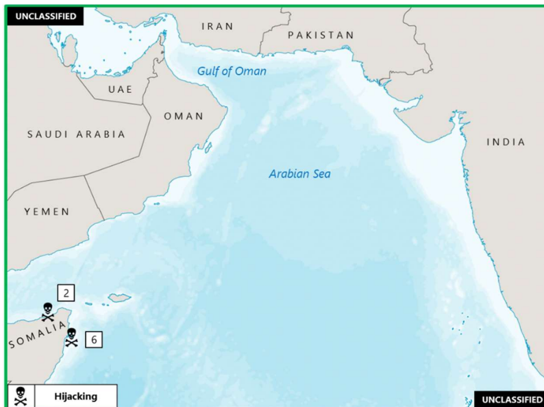
(U) Figure 2. Indian Ocean – East Africa Piracy and Armed Robbery at Sea

1. (U) RED SEA: On 2 January at 1850 UTC, approximately 33 NM east of Assab, Eritrea, the master of the Malta-flagged container ship CMA CGM TAGE reported three explosions within 5 NM of the vessel, near position 12:57N – 043:11E. The Houthi military spokesman said in a televised speech that the group had targeted the container ship after it ignored warnings. He did not say when or where the incident took place. CENTCOM said in a