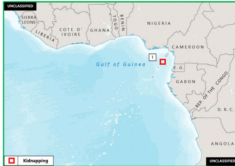
(U) Figure 1. West Africa – Gulf of Guinea Piracy and Armed Robbery at Sea

1. (U) EQUATORIAL GUINEA: On 1 January at 1930 UTC, pirates boarded the Tuvalu-flagged product tanker HANA I approximately 46 NM southwest of Bioko Island near position 02:33N – 008:13E on its voyage from Abidjan, Cote d'Ivoire, to Douala, Cameroon. The perpetrators abducted the master, chief engineer, and possibly seven other crew members. There has been no contact from the crew or their captors since they were kidnapped. The tanker arrived at Douala on 2 January. (Clearwater Dynamics; vesseltracker.com; Maritime Executive)