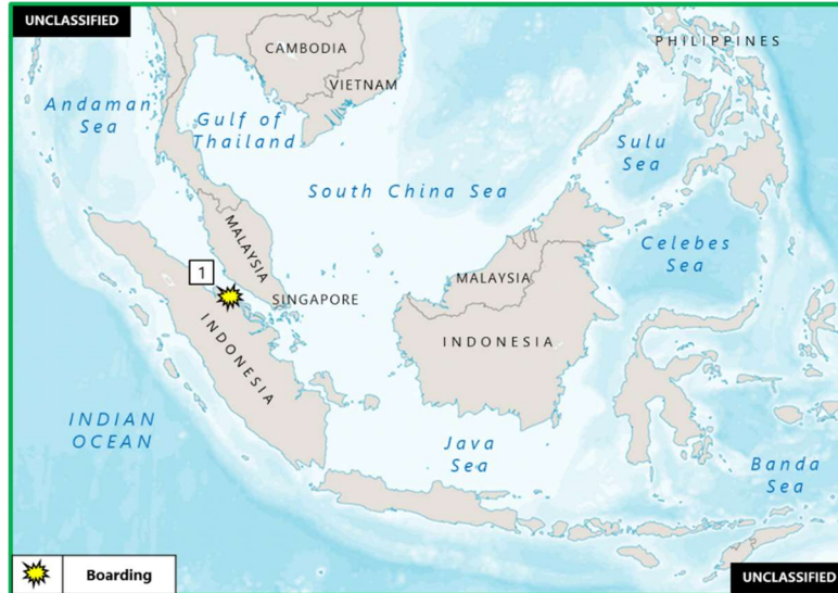
(U) Figure 3. East Asia – Southeast Asia Piracy and Armed Robbery at Sea

33. (U) RED SEA: On 6 December at 0718 UTC, UKMTO received a report of a drone loitering 49 NM southwest of Hodeida, Yemen, near position 14:25N – 042:12E. (UKMTO; Clearwater Dynamics)