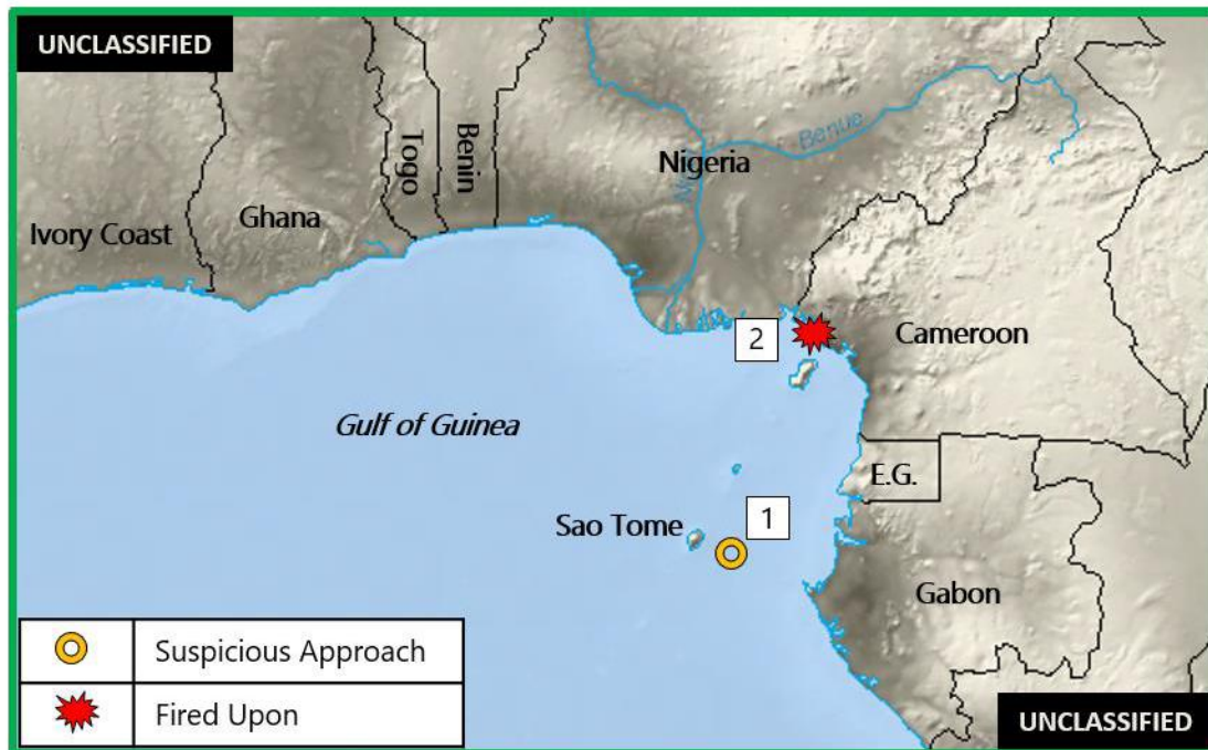
Figure 2. Gulf of Guinea Piracy and Maritime Crime