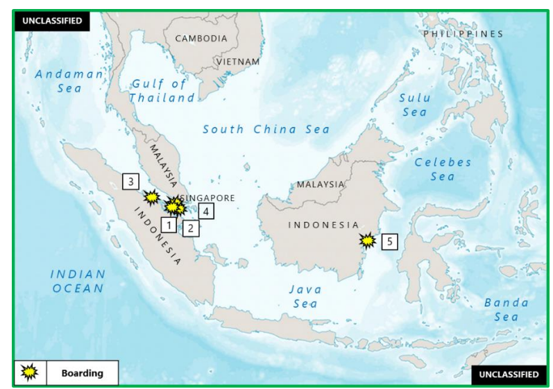
(U) Figure 4. East Asia – Southeast Asia Piracy and Armed Robbery at Sea

1. (U) INDONESIA: On 10 January at 0240 local time, five perpetrators, including one armed with a knife, boarded the underway Panama-flagged bulk carrier CMB CHIKAKO in the eastbound lane of the Singapore Strait Traffic Separation Scheme (TSS), near position 01:03N – 103:41E. The crew spotted the robbers in the engine room. The master raised the alarm, mustered the crew, and reported the boarding to local authorities. The crew thoroughly searched the vessel and found engine spare parts missing. The master reported all crew were safe and there were no injuries. The vessel did not require any assistance and continued its voyage to Singapore. (Clearwater Dynamics; ReCAAP)