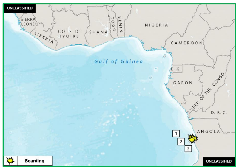
(U) Figure 1. West Africa – Gulf of Guinea Piracy and Armed Robbery at Sea

(U) ANGOLA: On 9 January at 0335 local time, as many as four robbers boarded a vessel anchored at Luanda Anchorage, near position 08:42S – 013:17E. After discovering the perpetrators on deck, the alarm was raised, and the robbers escaped in a small boat. A subsequent search revealed that six lifejackets and five immersion suits were missing. (MDAT-GoG; Clearwater Dynamics)