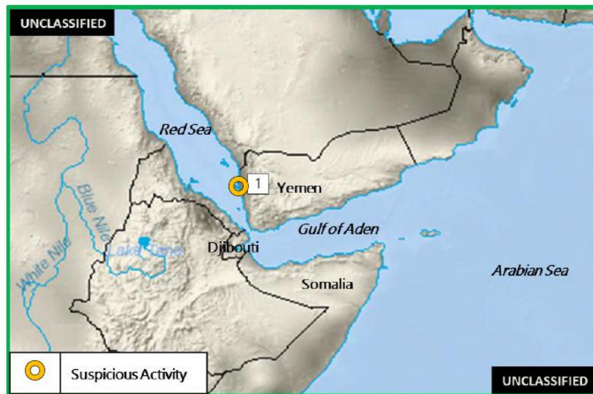
Figure 2. Red Sea Piracy and Maritime Crime

H. (U) INDIAN OCEAN - EAST AFRICA - RED SEA: