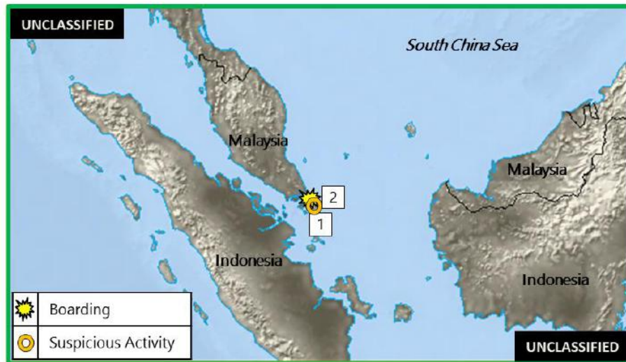
Figure 3. Southeast Asia Piracy and Maritime Crime

1. (U) INDONESIA: On 12 July at 0215LT, three robbers armed with knives boarded the eastbound Marshall Islands-flagged bulk carrier WOLVERINE in Singapore Strait near 01:16N - 104:15E. The robbers were spotted in the engine room. The alarm was raised, the crew were mustered, and the vessel was searched. The robbers escaped with ship's spare parts. The crew reported the incident to VTIS. (Clearwater Dynamics, ReCAAP)