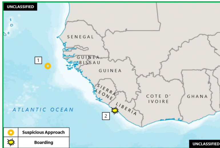
(U) Figure 1. West Africa – Gulf of Guinea Piracy and Armed Robbery at Sea

1. (U) GUINEA-BISSAU: On 20 February at 2250 UTC, one small boat approached an underway cargo ship approximately 160 NM west of Eiticoga Island, near position 11:24N – 018:50W. When the boat approached to within 0.9 NM, the vessel implemented evasive maneuvers and the boat aborted its approach. Following the incident, the crew and vessel were reported safe. (MDAT-GoG; Clearwater Dynamics)