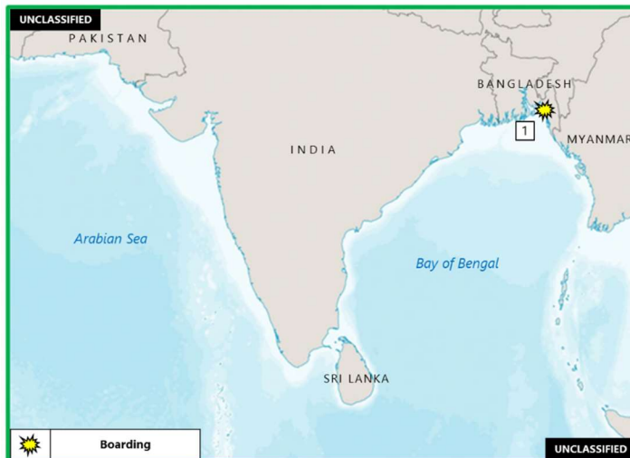
(U) Figure 4. Indian Subcontinent Piracy and Armed Robbery at Sea

1. (U) BANGLADESH: On 16 February at 2130 local time, four robbers armed with knives boarded a container ship anchored at Chittagong Anchorage, near position 22:09N – 091:46E. After the duty watch stander observed the robbers, the alarm was raised and the crew mustered. The crew conducted a search and discovered ship's stores had been stolen. The master notified port control, local agents, and the coast guard. (IMB; Clearwater Dynamics)