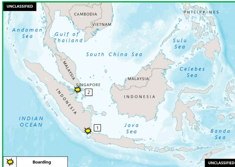
(U) Figure 3. East Asia – Southeast Asia Piracy and Armed Robbery at Sea

1. (U) INDONESIA: On 20 February at 0400 local time, two robbers armed with knives boarded an anchored bulk carrier at Panjang Anchorage, near position 05:29S – 105:17E. The duty oiler spotted the robbers in the engine room and raised the alarm after evading capture by the robbers. Seeing the crew's alertness, the robbers escaped with ship's spare engine parts. The crew was reported safe and the incident was reported to local authorities. (IMB; Clearwater Dynamics)