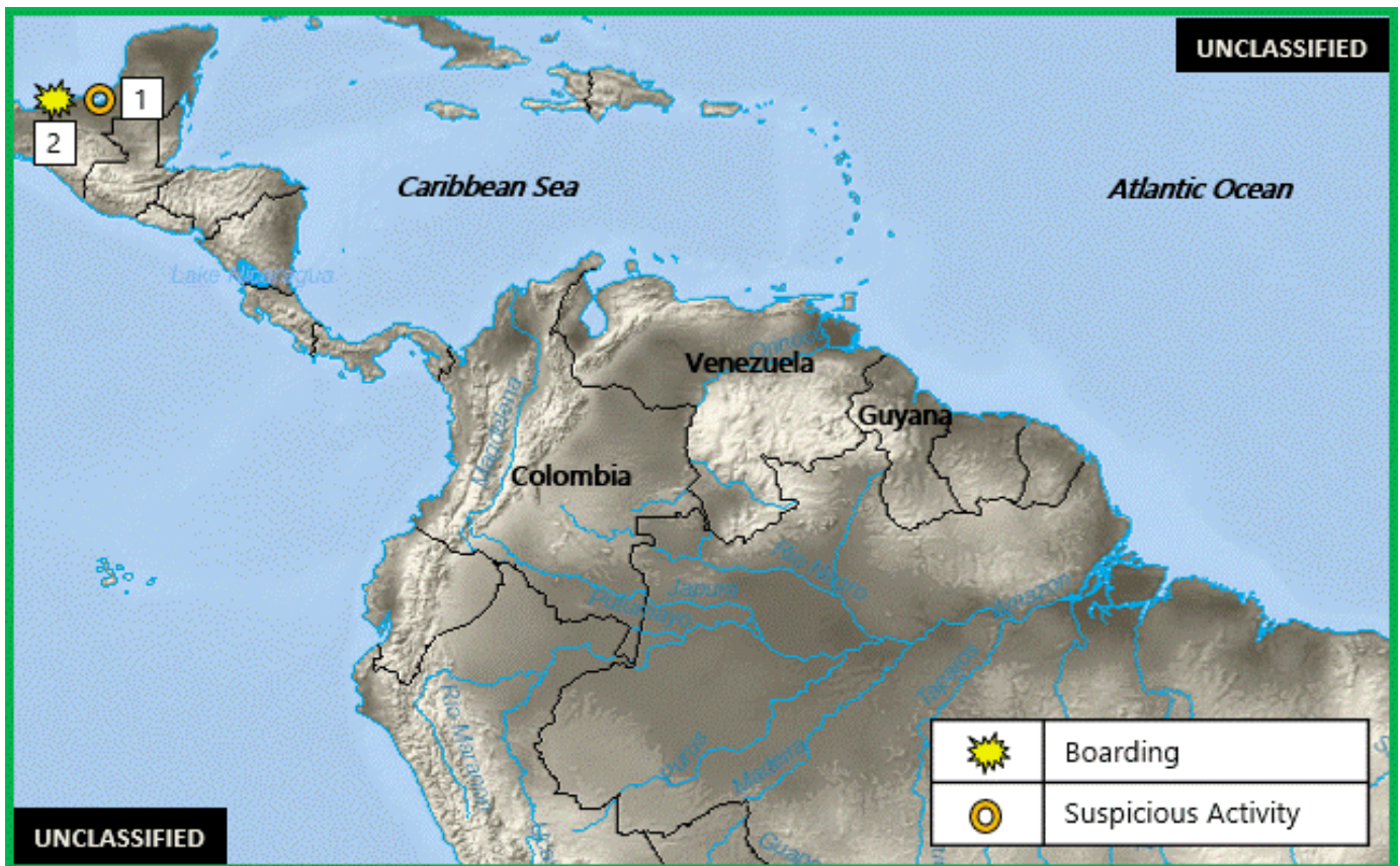
Figure 1. North America Piracy and Maritime Crime