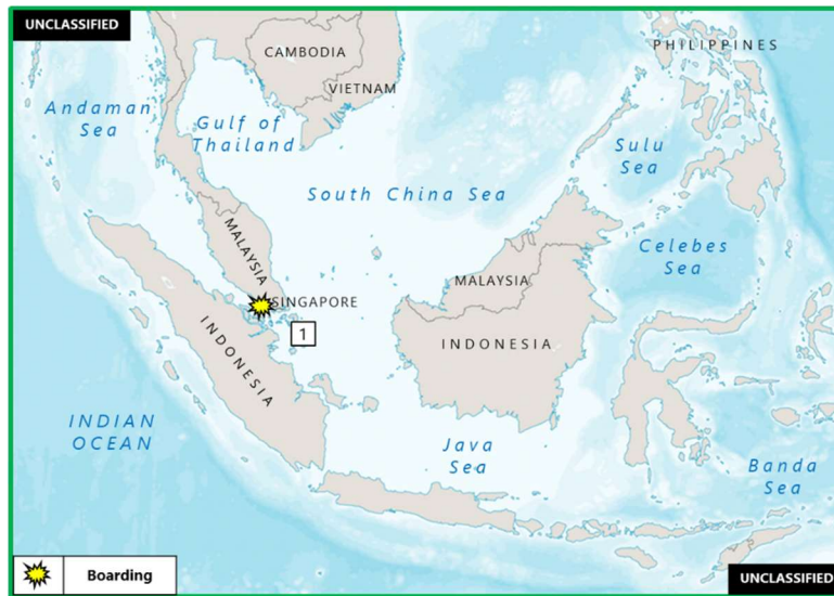
(U) Figure 2. East Asia – Southeast Asia Piracy and Armed Robbery at Sea

1. (U) MALAYSIA: On 26 March at 0854 UTC, four perpetrators in a fishing boat came alongside and boarded a drill ship under tow by an offshore tug in the Malacca Strait, near position 01:26N – 103:11E. The master of the tug requested assistance from the IMB Piracy Reporting Center, who then contacted the Malaysia Maritime Enforcement Agency (MMEA). MMEA dispatched a patrol boat to the vessel's position. A search by the patrol boat did not reveal any perpetrators and the offshore tug and drill ship continued their transit. (IMB; Clearwater Dynamics)