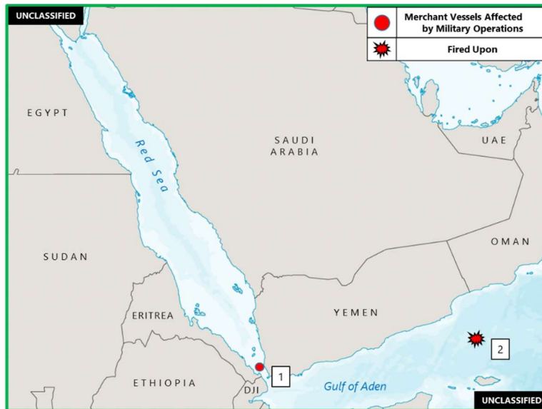
(U) Figure 1. Indian Ocean – East Africa – Red Sea Piracy and Armed Robbery at Sea

1. (U) RED SEA: On 23 March, anti-ship ballistic missiles (ASBMs) launched from Houthi-controlled territory targeted the Panama-flagged, Chinese-owned, Chinese-operated crude oil tanker HUANG PU while underway. Within a 12-hour period, four ASBMs landed in the vicinity of the tanker. At 1435 UTC, a fifth missile hit the vessel approximately 23 NM west of Mokha, Yemen, near position 13:17N – 042:53E. The resulting onboard fire was extinguished within 30 minutes by the crew. The crew and vessel were reported safe and the tanker continued its voyage. The U.S. military noted that the Houthis attacked the tanker HUANG PU despite previously stating they would not attack Chinese vessels. (UKMTO; Clearwater Dynamics; vesseltracker.com; U.S. Central Command)