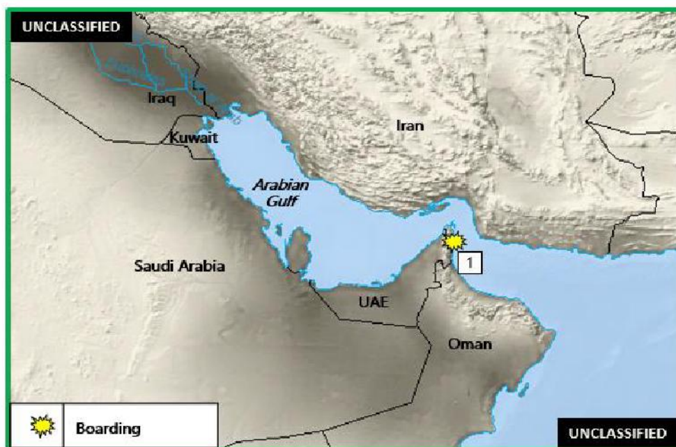
Figure 3. Gulf of Oman Piracy and Maritime Crime