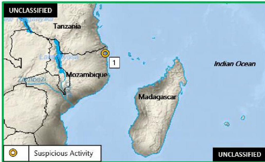
Figure 4. East Africa Piracy and Maritime Crime

1. (U) MOZAMBIQUE: On 12 August, Islamist insurgents with links to Islamic State took control of the heavily defended port in the town of Mocimboa da Praia at 11:20S - 040:21E when the government naval forces ran out of ammunition. The port is 37 miles from where the French company Total is developing a $60 billion liquid natural gas plant. (Bloomberg, Marine Link, Dryad Global)