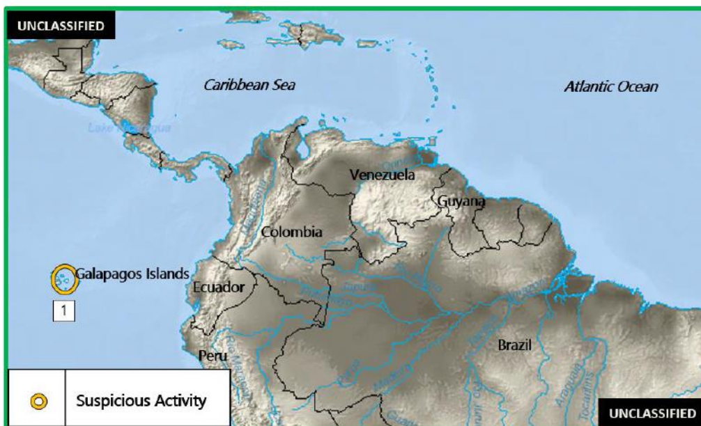
Figure 1. South America Piracy and Maritime Crime

1. (U) ECUADOR: On 10 August, the Ecuador Navy detected a large number of Chinese fishing vessels near Galapagos Islands. The fishing fleet of 340 fishing vessels, mostly China-flagged, was operating in international waters just outside the exclusive economic zone around the Galapagos Islands. The Ecuadorian officials raised their concerns about the environmental impact of such a large Chinese fishing fleet operating near the protected and ecologically-sensitive waters of the Galapagos Islands. (REUTERS, GCaptain)