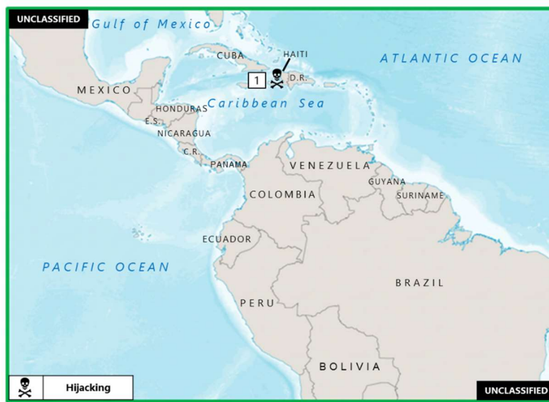
(U) Figure 1. Central America – Caribbean – South America Piracy and Armed Robbery at Sea

1. (U) HAITI: During the evening of 13 April, heavily armed individuals hijacked the ship JEVI VLE and kidnapped its six crew members near Arcahaie, on the eastern side of the Gulf of Gonâve and approximately 16 NM northwest