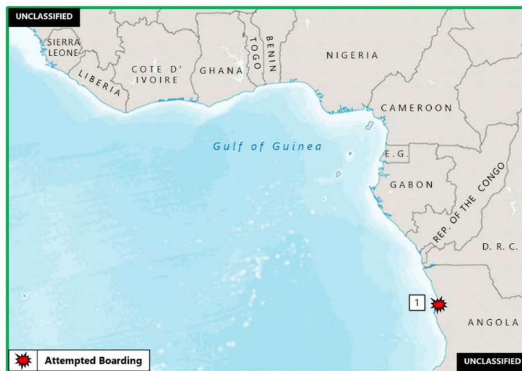
(U) Figure 2. West Africa – Gulf of Guinea Piracy and Armed Robbery at Sea

1. (U) ANGOLA: On 12 April at 0045 local time, two wooden boats approached and lingered on the port side of a fire fighting vessel anchored at Luanda Anchorage, near position 08:44S – 013:18E. The officer of the watch raised the alarm after observing the boats' approach and subsequent landing on the port side of the vessel. Upon hearing the alarm, the boats moved away from the anchored vessel. (Clearwater Dynamics)