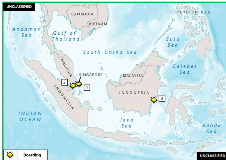
(U) Figure 4. East Asia – Southeast Asia Piracy and Armed Robbery at Sea

1. (U) MALAYSIA: On 14 April at 1020 local time, three or four robbers boarded the barge HEXAGRO 9 under tow by the Malaysia-flagged tug BONGAWAN 9 in the westbound lane of the Singapore Strait Traffic Separation Scheme (TSS), near position 01:18N – 104:15E. Approximately 20 minutes later, the master reported that the robbers had left the barge. The master reported to Singapore Vessel Traffic Information System (VTIS) that the crew was safe, scrap metal had been stolen, and that no assistance was required. (ReCAAP)