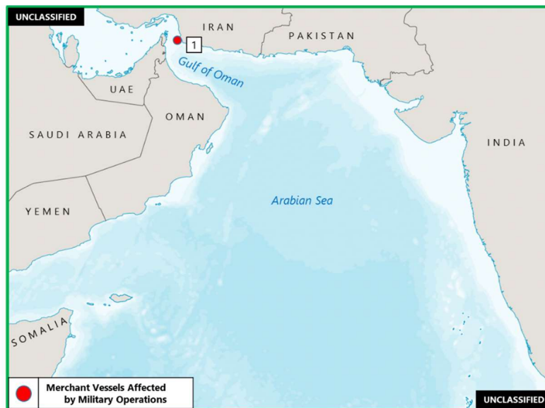
(U) Figure 3. Indian Ocean Piracy and Armed Robbery at Sea

1. (U) ARABIAN GULF: Overnight between 2 April 2300 UTC and 3 April 0100 UTC, a vessel experienced a disruption to maritime electronic navigation systems (GPS/AIS) approximately 95 NM east of Ras Al Zour, Saudi Arabia (exact position not specified). (UKMTO)