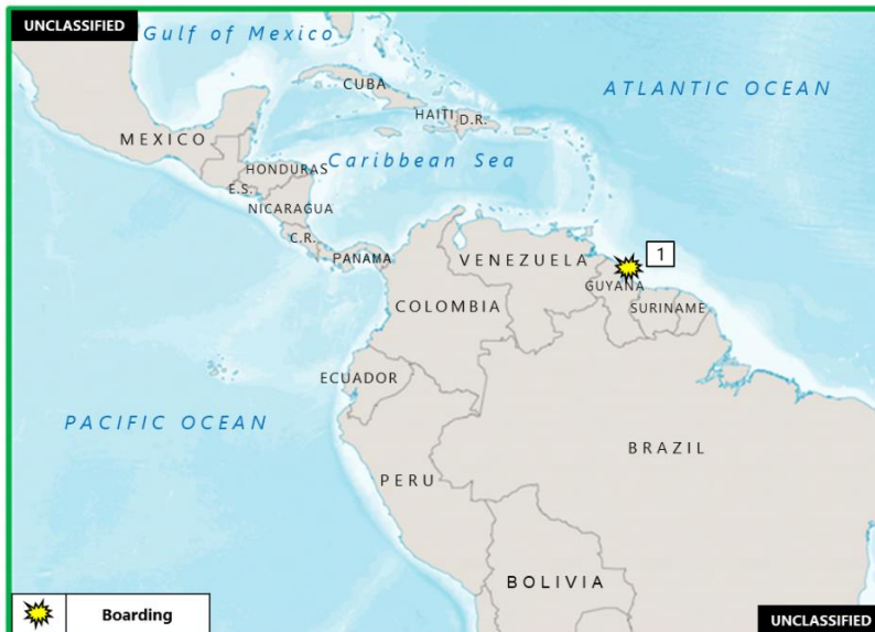
(U) Figure 1. Central America – Caribbean – South America Piracy and Armed Robbery at Sea

B. (U) CENTRAL AMERICA – CARIBBEAN – SOUTH AMERICA: