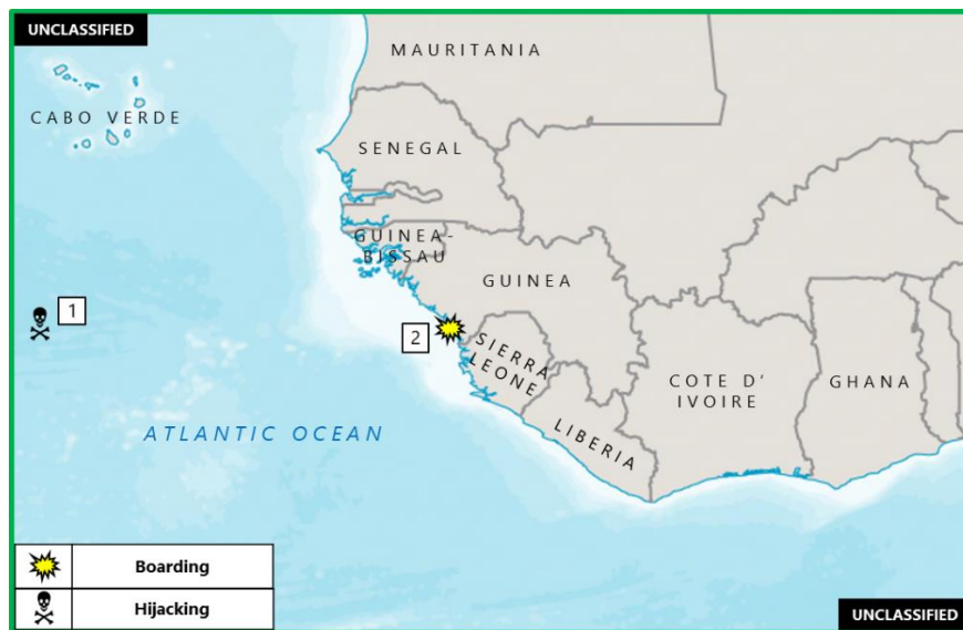
(U) Figure 1. West Africa Piracy and Armed Robbery at Sea

1. (U) WEST AFRICA: On 17 May at 0410 UTC, 10 pirates armed with AK-47 automatic rifles hijacked the Palau-flagged product tanker FIDAN while underway approximately 363 NM south-southwest of Nova Sintra, Cabo Verde, and approximately 700 NM off the coast of West Africa, near position 09:11N – 027:03W. The pirates took