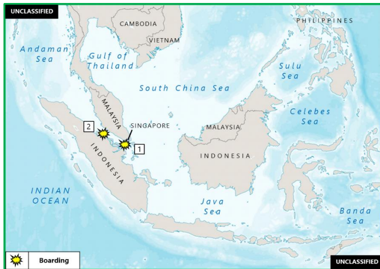
(U) Figure 4. Southeast Asia Piracy and Armed Robbery at Sea

1. (U) INDONESIA: On 21 May at 0513 local time, five perpetrators armed with knives boarded a bulk carrier underway in the eastbound lane of the Singapore Strait Traffic Separation Scheme (TSS), near position 01:02N – 103:39E. The crew spotted the perpetrators in the steering spaces and notified the bridge. After the bridge raised the alarm, the perpetrators fled the vessel. The master later reported all crew safe and that nothing was stolen. The vessel did not require any assistance and continued its voyage. (Clearwater Dynamics)