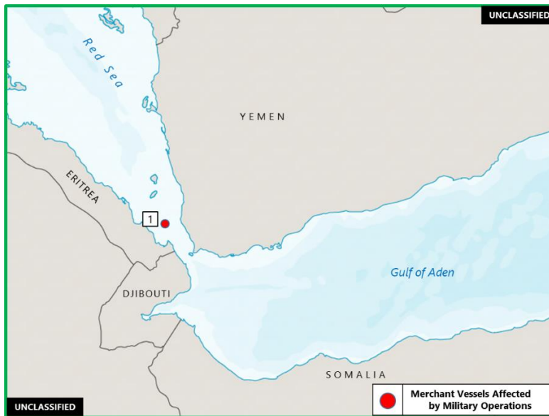
(U) Figure 2. East Africa Piracy and Armed Robbery at Sea