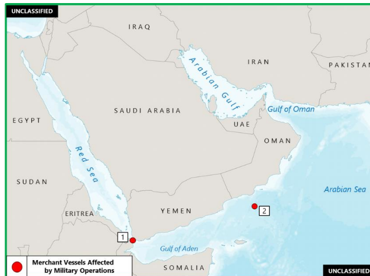
(U) Figure 1. East Africa – Arabian Sea Military Operations against Merchant Vessels

1. (U) BAB EL MANDEB STRAIT: On 10 July at 0240 UTC, a missile exploded about 600 meters from the port side of a Liberia-flagged crude oil tanker while underway approximately 40 NM south of Mokha, Yemen (exact position not specified). The master reported the vessel and all crew members were safe, and that the vessel proceeded to its next port of call. (UKMTO; Clearwater Dynamics)