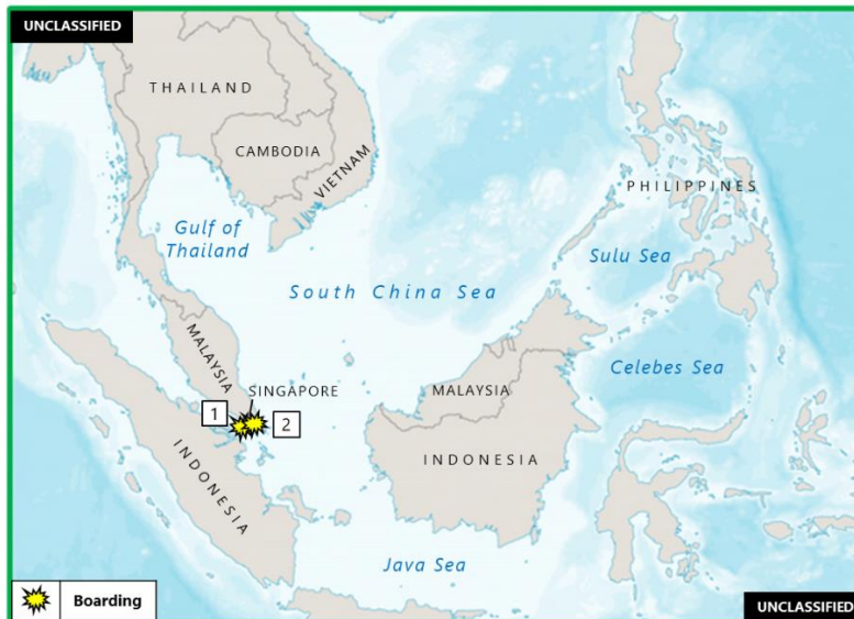
(U) Figure 2. Southeast Asia Piracy and Armed Robbery at Sea

1. (U) INDONESIA: On 8 July at 0410 local time, four perpetrators boarded the Japan-flagged bulk carrier ORIHIME in the eastbound lane of the Singapore Strait Traffic Separation Scheme (TSS), near position 01:03N – 103:39E. The duty crew spotted the perpetrators at the vessel's stern. After the master raised the alarm, the crew mustered to conduct a search of the vessel. The ship later reported that all crew members were safe, nothing had been stolen, and that the vessel did not require assistance. The vessel continued its transit to its next port of call. (Clearwater Dynamics; ReCAAP)