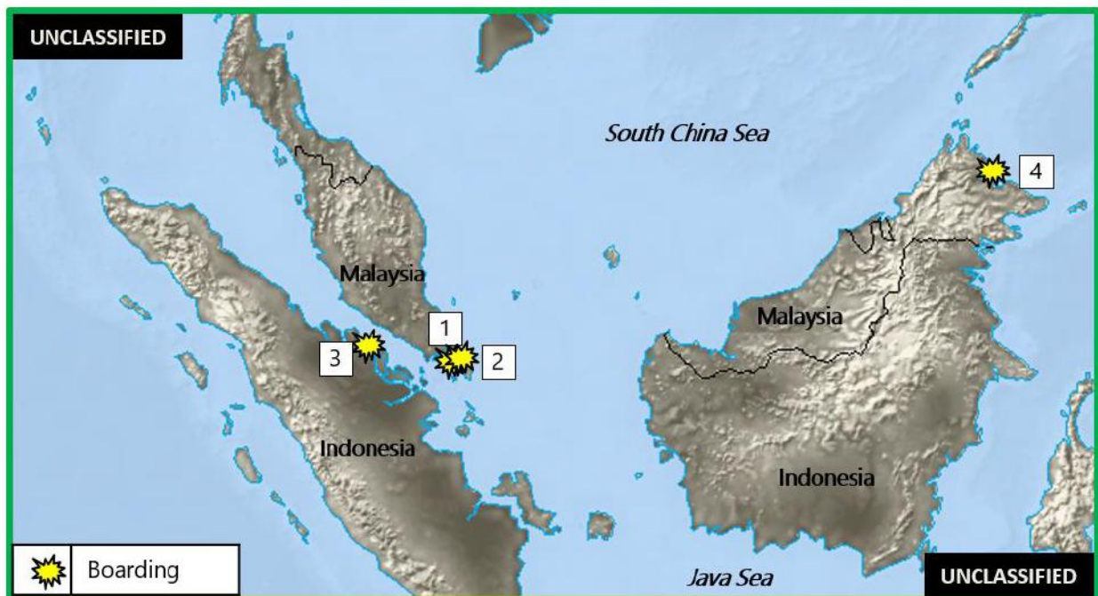
Figure 4: Southeast Asia Piracy and Maritime Crime