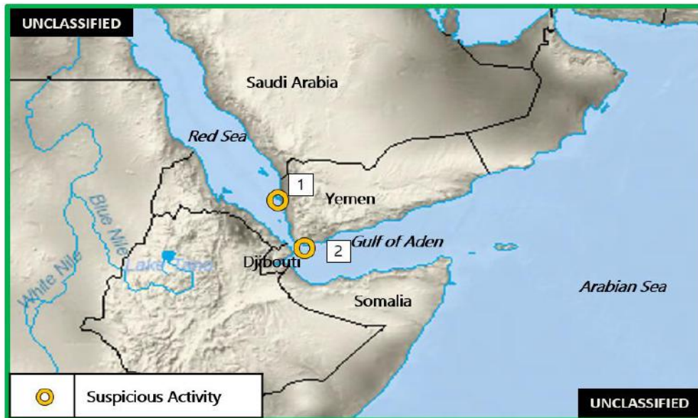
Figure 2: Arabian Gulf Piracy and Maritime Crime

1. (U) YEMEN: On 31 August, the Saudi-led military coalition intercepted and destroyed an unmanned, remotely-controlled, explosive laden boat in Hodeidah governorate in the Red Sea. In a press statement, the coalition said the bomb-laden boat was launched by the Iran-backed Houthi "terrorist" militia. (Dryad Global, Saudi Press Agency)