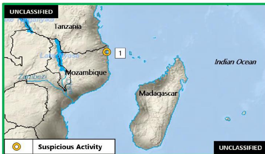
Figure 3: East Africa Piracy and Maritime Crime

2. (U) YEMEN: on 31 August at 0810 LT, two skiffs approached an underway Singapore-flagged tanker 26.5 NM southeast of Perim Island, near the Bab el Mandeb Strait at position 12:26N - 043:46E. The skiffs with six persons onboard came to within 300 meters when the vessel sounded the alarm. The skiffs aborted their approach upon seeing the vessel's security team onboard. The vessel continued safely to its destination. (Clearwater Dynamics)