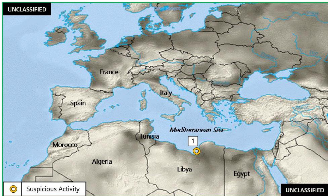
Figure 1: Mediterranean Sea Piracy and Maritime Crime

1. (U) LIBYA: On 4 September at 0200LT, a group of armed men under the command of the Petroleum Facilities Guard (PFG) – including foreign mercenaries – forced the Comoros-flagged ship MOHAMED BEY into Ras Lanuf port. The armed men fired live rounds and RPG shells to the vessel's flammable and dangerous area, which intimidated the crew into yielding to their demands. The vessel was scheduled to enter the commercial section of Ras Lanuf port at 1100LT on the same day to load scrap when commandeered. There were no casualties reported. (Libya Herald, BBC)