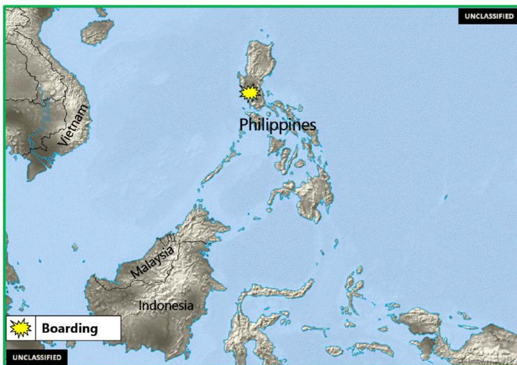
Figure 4: Southeast Asia Piracy and Maritime Crime

1. (U) PHILIPPINES: On 4 September at 0345LT, robbers managed to board the Liberia-flagged vessel AAL NANJING at the Manila OPL Anchorage undetected. The crew discovered the robbery when they noticed the forecandle store was open and ship's properties were missing. The crew subsequently searched the vessel, but found no robbers. The crew notified a Philippines Coast Guard vessel patrolling in the area and the Philippine Port Authority. (Clearwater Dynamics, GISIS IMO)