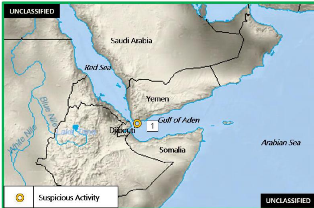
Figure 3: Arabian Gulf Piracy and Maritime Crime