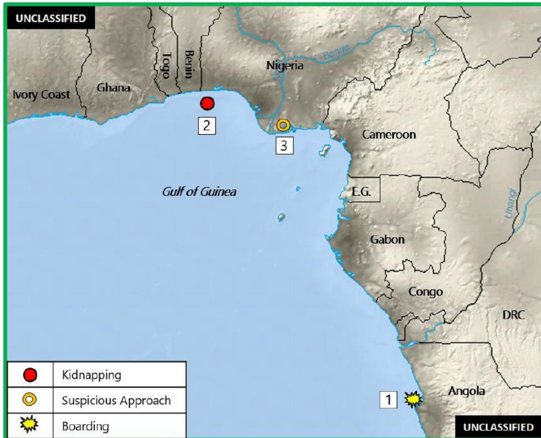
Figure 2. Gulf of Guinea Piracy and Maritime Crime

1. (U) ANGOLA: On 8 September at 2254LT, robbers boarded a container vessel using the anchor chain at Luanda Anchorage near position 08:45S - 013:17E. When the crew spotted the robbers and raised the alarm, the robbers fled empty handed. (Clearwater Dynamics)