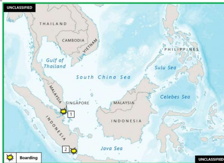
(U) Figure 2. Piracy and Armed Robbery at Sea in Southeast Asia