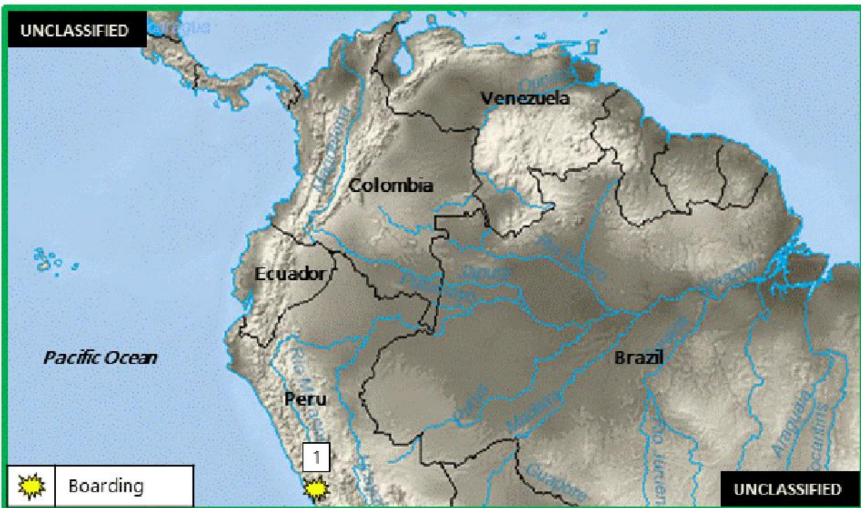
Figure 1. Central America – Caribbean – South America Piracy and Maritime Crime

B. (U) CENTRAL AMERICA - CARIBBEAN - SOUTH AMERICA: