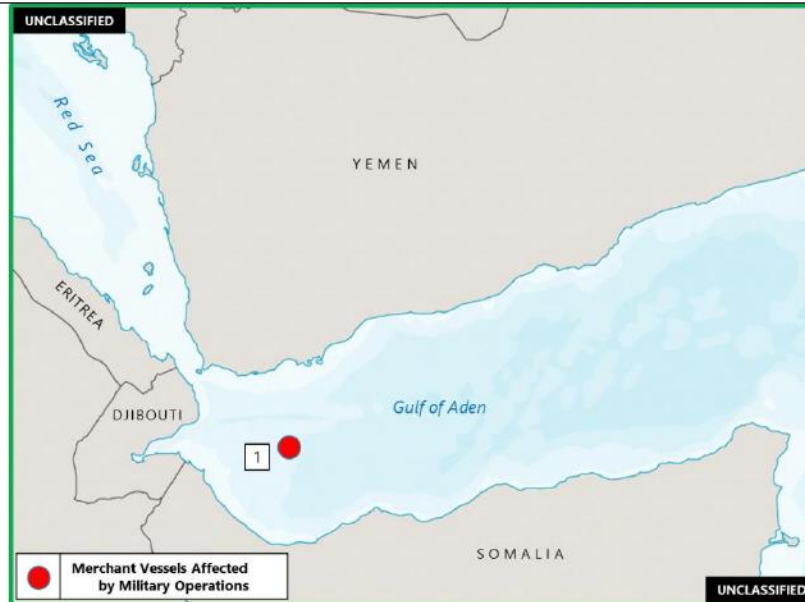
(U) Figure 2. Merchant Vessels Affected by Military Operations in the Gulf of Aden