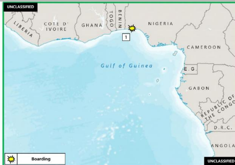
(U) Figure 1. Piracy and Armed Robbery at Sea in West Africa – Gulf of Guinea