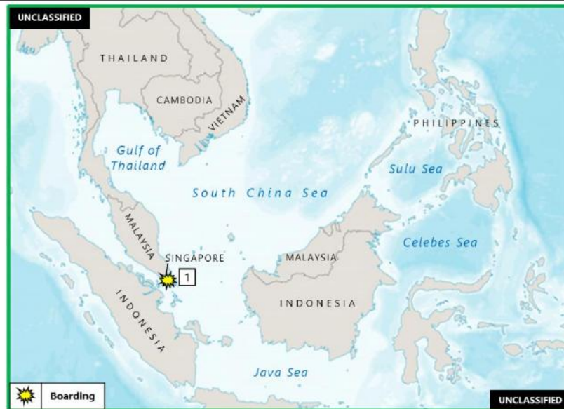
(U) Figure 4. Piracy and Armed Robbery at Sea in Southeast Asia