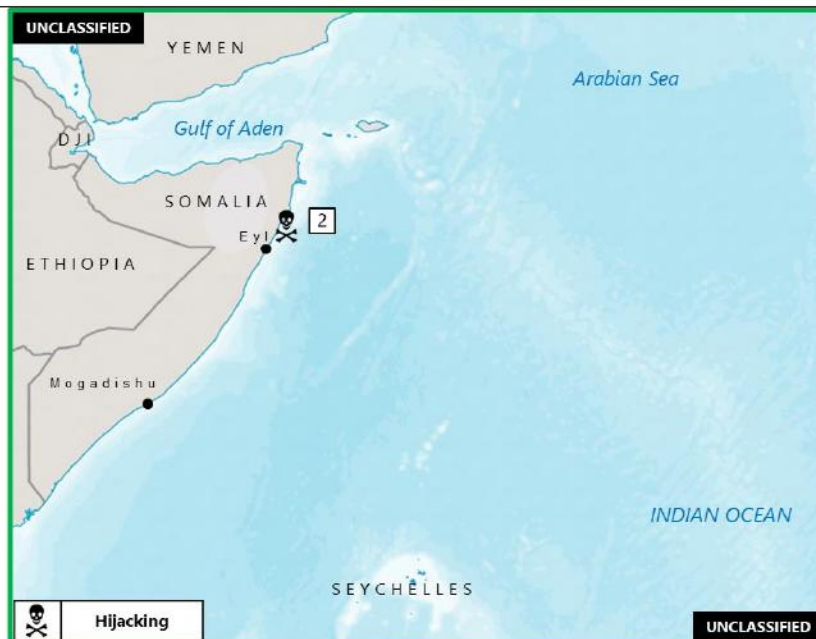
(U) Figure 3. Piracy and Armed Robbery at Sea in the Indian Ocean