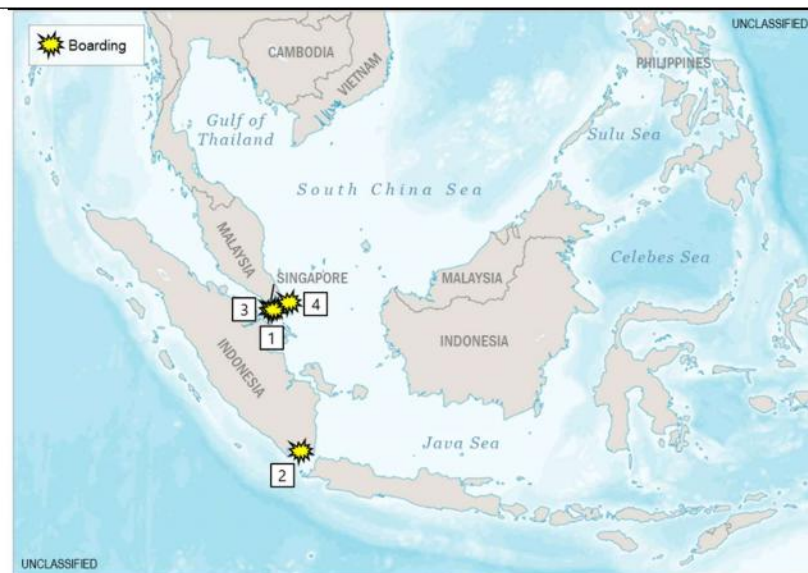
(U) Figure 2. Piracy and Armed Robbery at Sea in Southeast Asia