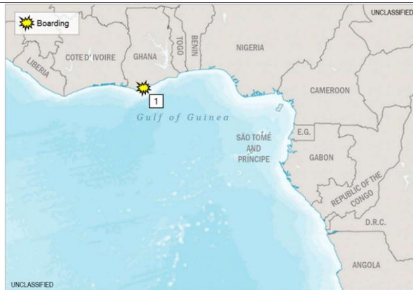
(U) Figure 1. Piracy and Armed Robbery at Sea in West Africa – Gulf of Guinea